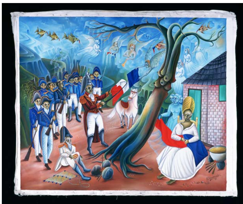
Figure 5. Madsen Mompremier, Dessalines Ripping the White from the Flag , 1995. Oil on canvas, 77.2 × 91.4 cm.

Mompremier's painting, the tree combines the upright phallic with the maternal breasts of sustenance as the new symbols of the first new Black republic are born.