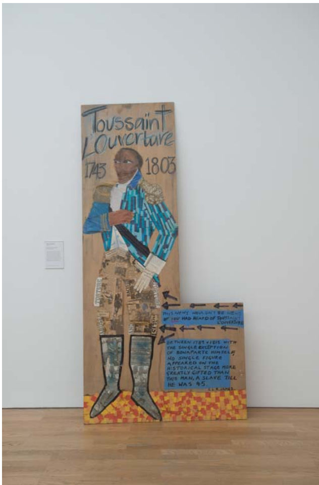
Figure 3. Lubaina Himid, Toussaint L'Ouverture , paint and collage on wood, 1987. ©Lubaina Himid.

What is also dignified is the revolutionary's military uniform. As in Ramsay's Blakk-Jacobin , Louverture's coat comes to life. The multilayered coat is made up of multiple paper strips in different shades of blue, while the epaulette is composed of drawing pins. Louverture's silhouette is mounted red, gold and yellow square paper pieces. As