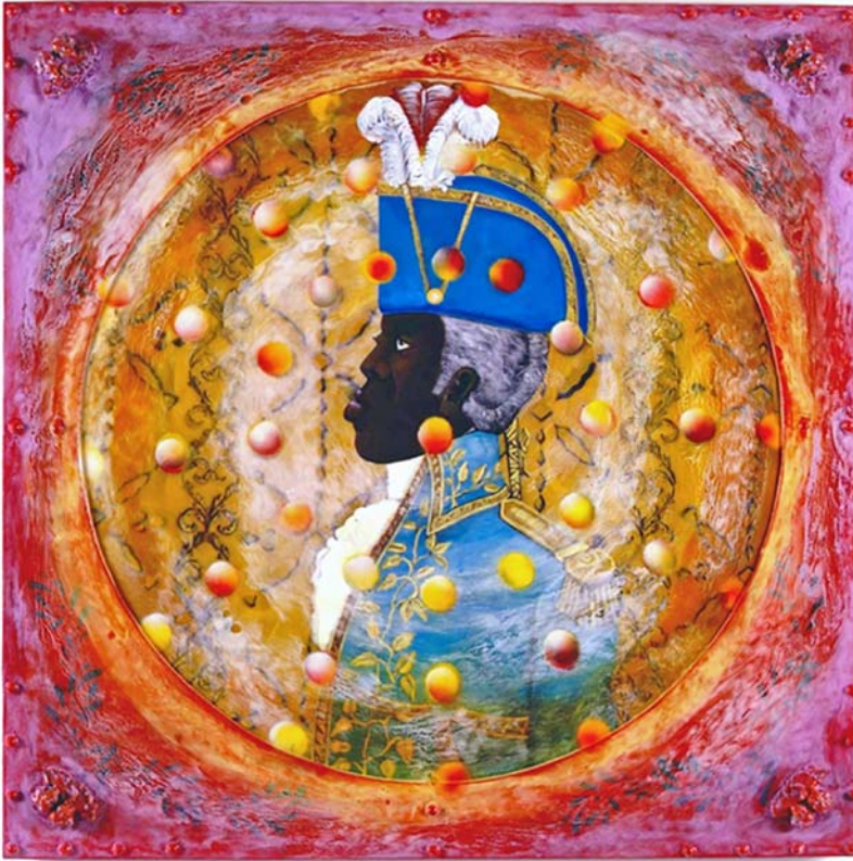
Figure 4. Édouard Duval-Carrié, Le Général Toussaint enfumé , 2001. ©Édouard Duval-Carrié. Courtesy of Rum Nazon, Cap Haïtien.

Rasanblaj can also refer to Haitian-style rebuilding after disasters like the 2010 earthquake and Hurricane Matthew in 2016. Rasanblaj can be a survival tactic.