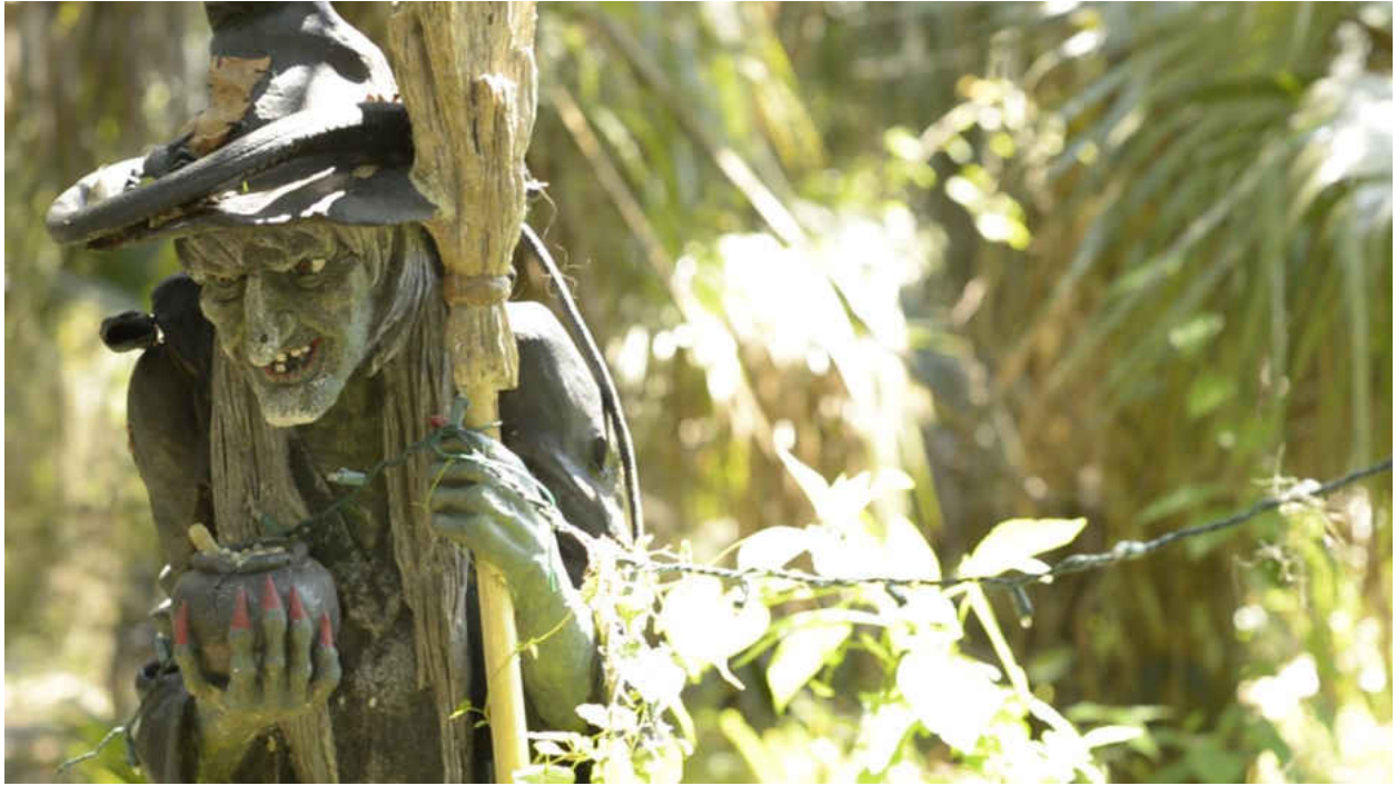
Figure 3. A witch guards Art Litka's yard as part of his year-round Halloween display