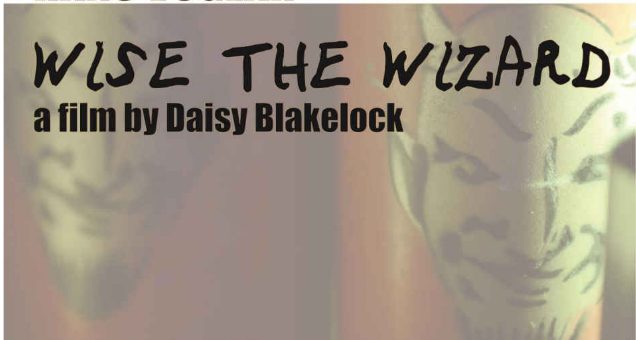
Figure 7. Sample Artwork