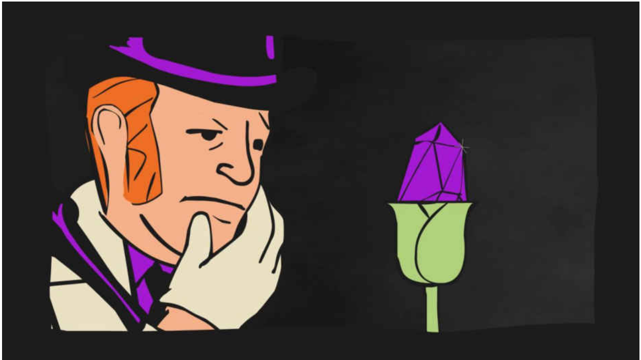
Figure 4. Animated reenactments give the film a playful feel