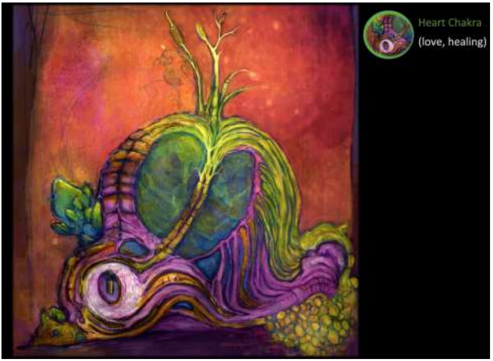
"Anahata", Corrupted Chakras: A Bestiary, 2016