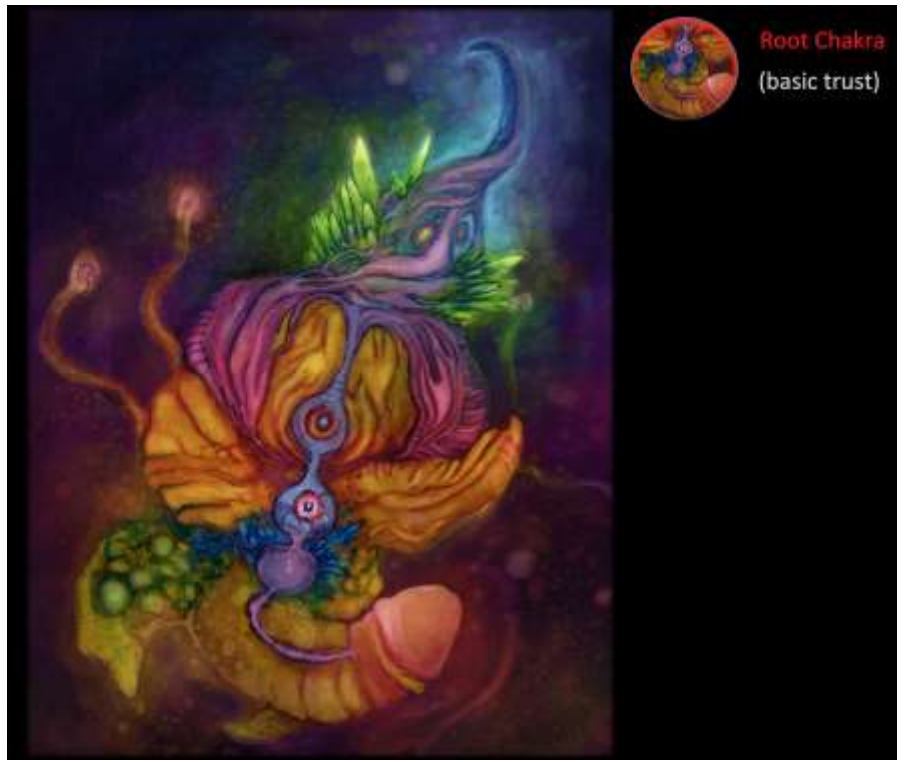
"Muladhara", Corrupted Chakras: A Bestiary, 2016