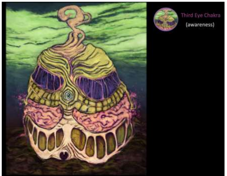
"Anja", Corrupted Chakras: A Bestiary, 2016