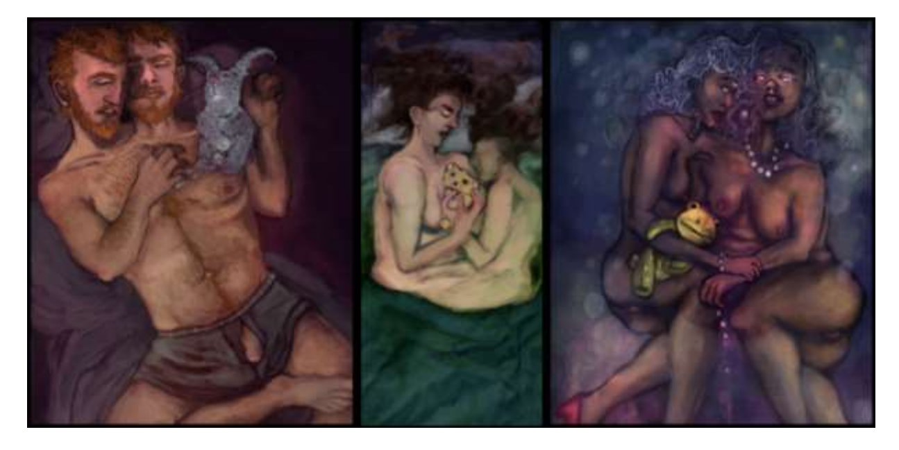
Figure 4, "Conjoined Twins" series

invulnerability from external influences. And here it serves a similar function in my earliest work of the program, from the Conjoined Twins series - a marriage of my personal biology (of being an identical twin) and the unconscious influence of Mother and Child (shown in Figure 4 ).