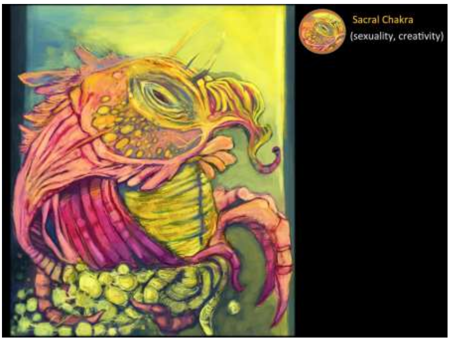
"Svadisthana", Corrupted Chakras: A Bestiary, 2016