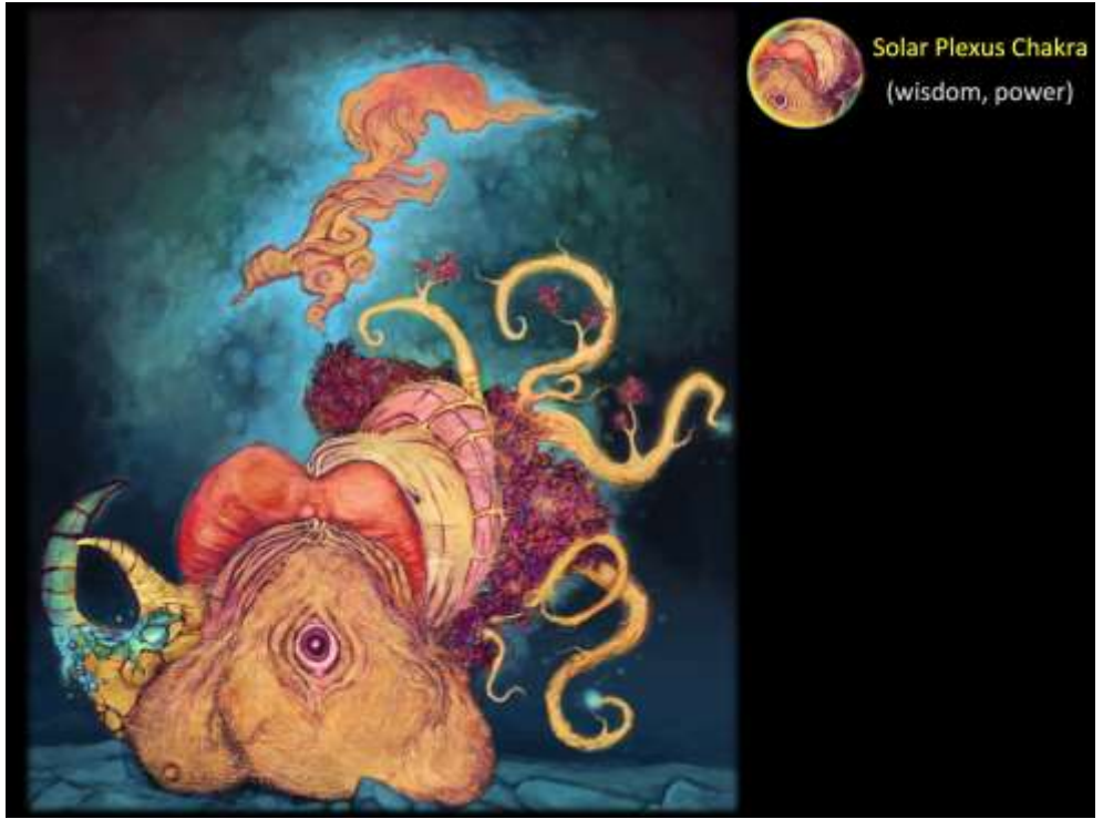
"Manipura", Corrupted Chakras: A Bestiary, 2016