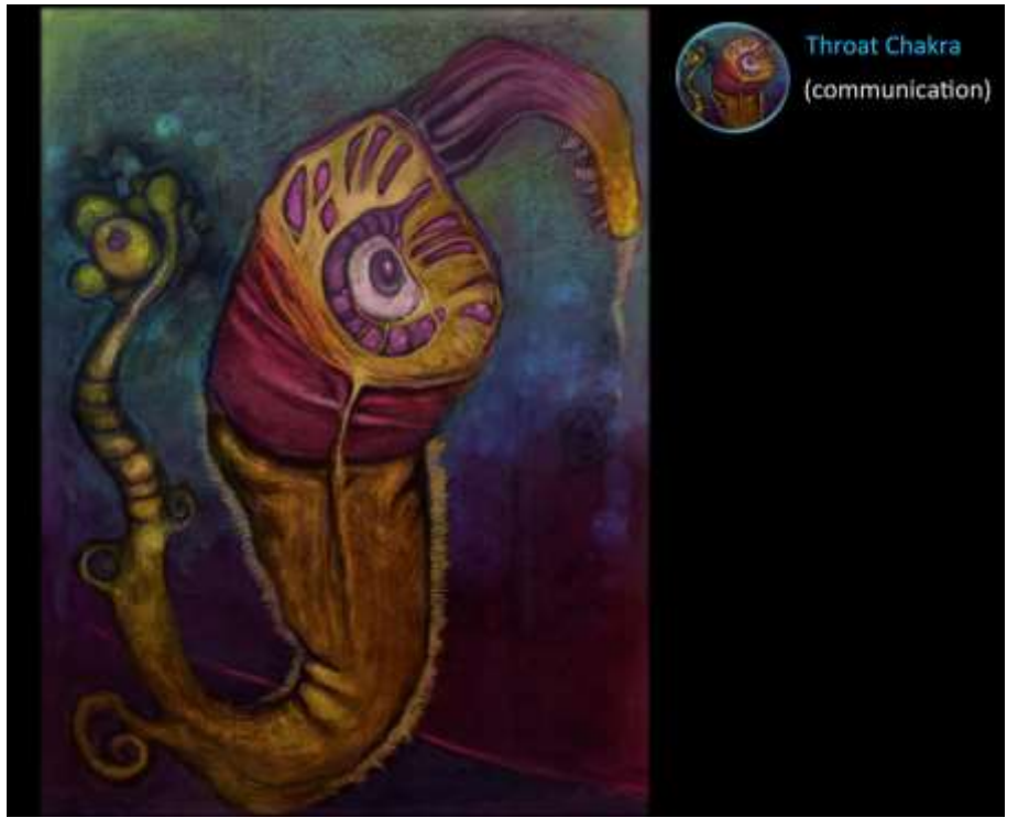
"Visuddha", Corrupted Chakras: A Bestiary, 2016