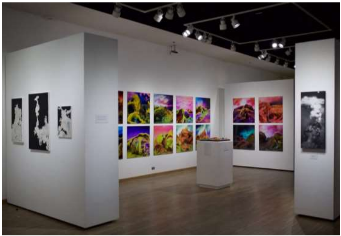
Installation view 1, "Numinous", 2017