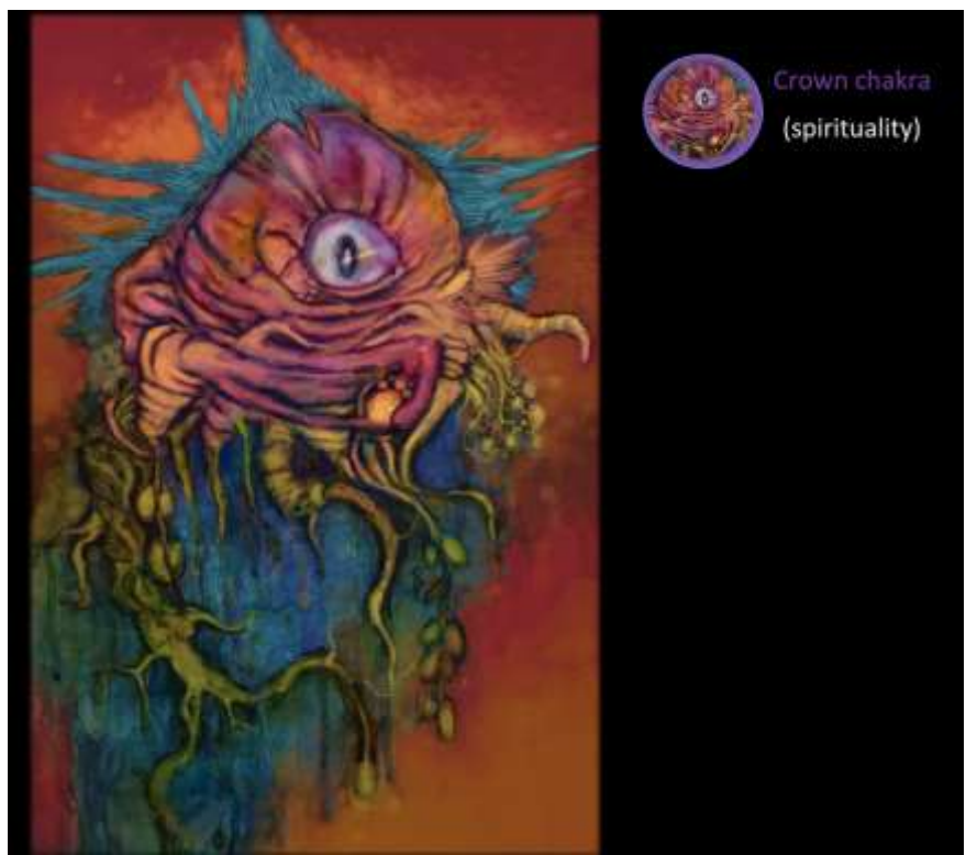
"Sahasrara", Corrupted Chakras: A Bestiary, 2016