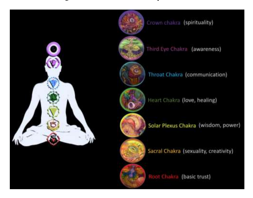
Figure 5, Chakra Chart

The chakra centers of the body are of particular interest to me: Manipura (crown), Anahata (third-eye), Visuddha (throat), Svadisthana (heart), Sahasrara (solar plexus), Anja (sacral), and Muldahara (root) respectively (illustrated in Figure 5 ). They function independently, but are all co-dependent on one other in order to achieve proper homeostasis or alignment within the human body.