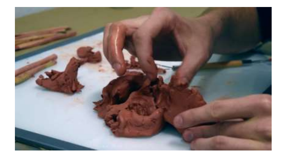
Figure 2, Asmita Samadhi

As an art maker, I am not a purist; that is to say I do not romanticize the notion of separate schools of art making. Although I do gravitate towards certain materials, the main consideration towards media choice is how it might be utilized as a tool to create art work. I pay special heed to process, which is at times methodical and labor intensive. This mode of working innately has its strengths and drawbacks. Namely it is powerful in its ability to act as an active meditation. When you focus intently on an object, the ego becomes temporarily subverted. In the Sutras, this state is regarded as Asmita Samadhi or the merging of the mind with the object of meditation (demonstrated through method in Figure 2 ).