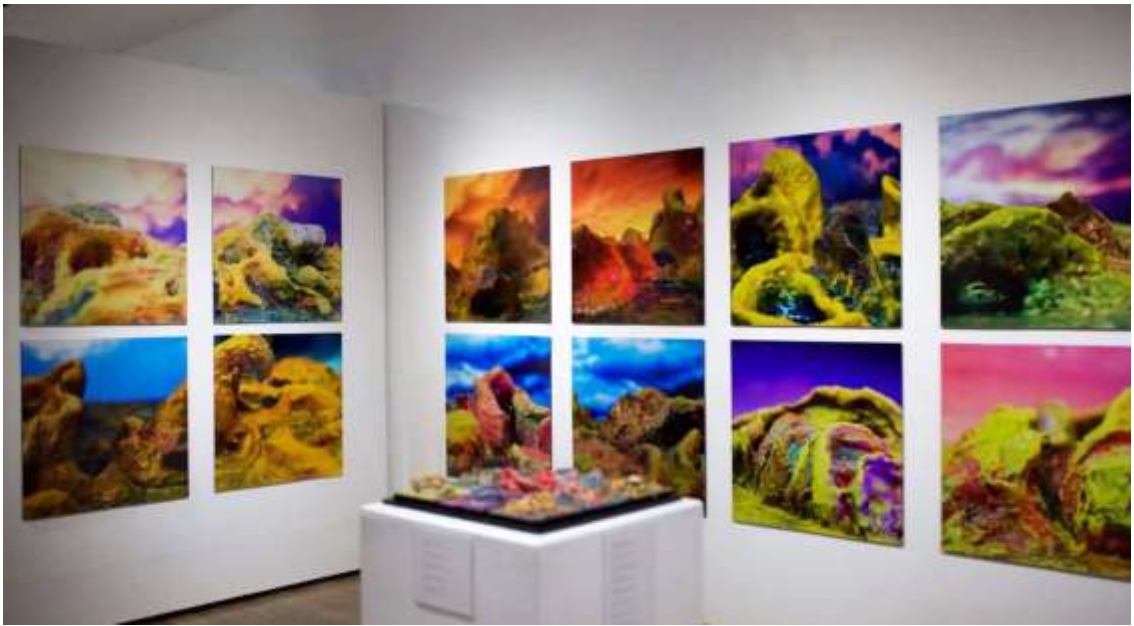
Installation view 2, "Numinous" 2017