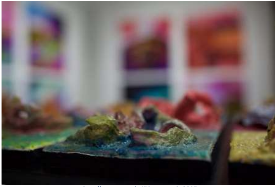
Installation view 3, "Numinous", 2017