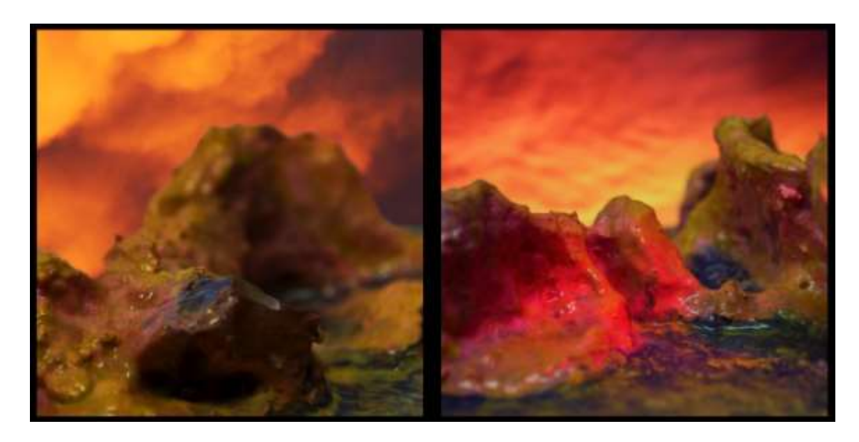
Figure 8, "Sweltering Scoria", 2017