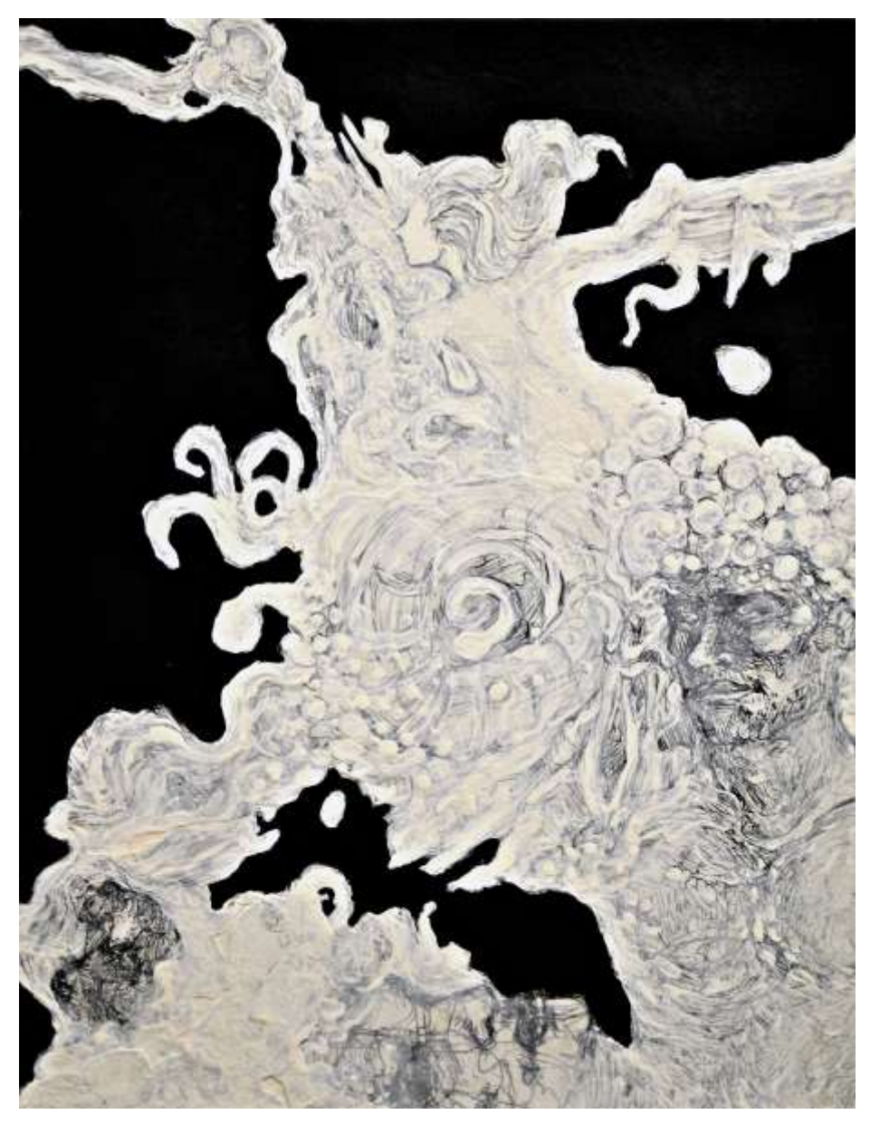
Figure 9, "Chitta Vritti", 2017

This work (seen in Figure 9 ) from the State of Mind: Chitta Vritti series deals with transformation - transforming something that does not serve you into something that does. My primary goal was to temporarily quiet the mind as a coping strategy for mitigating neurotic thought processes. The act of methodical art making (an active meditation) can be