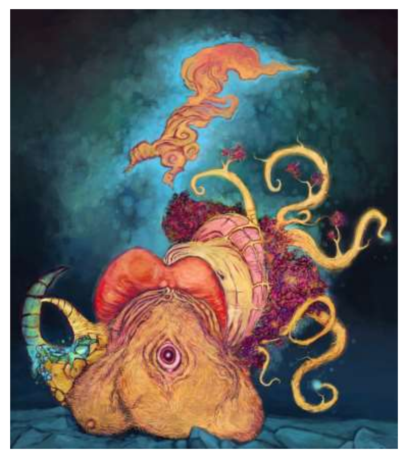
Figure 6, "Visuddha", 2016

why are they chronically problematic by either being too closed, too open, or imbalanced? Trying to imagine these centers was an attractive idea to address because of their esoteric and abstract nature.