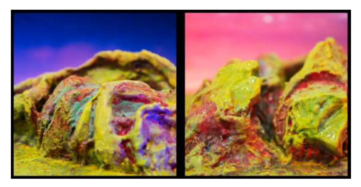
Figure 7, "Noxious Abalone", 2017