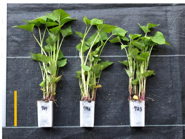
Figure 2. The case-held tuber seedlings of cultivar Beniharuka after 23 d incubation, and on the day of transplantation into the field. The vertical bar indicates 10 cm.