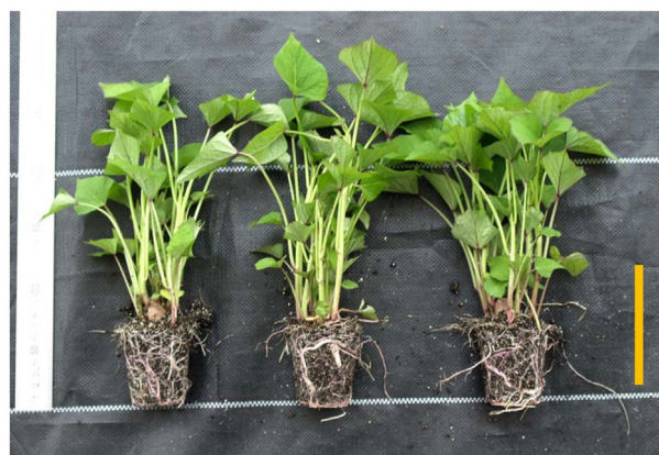
Figure 3. The tuber seedlings grown in a cell tray of cultivar Beniharuka after 20 d incubation, and on the day of transplanting into the field. The vertical bar indicates 10 cm.

In the growth survey at 53 DAP for CTST and VP, and 50 DAP for TST, the FW of daughter tubers (more than 5 mm