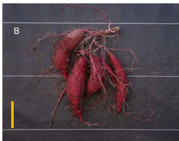
Figure 4. The stubble with daughter tubers and a case-held mother tuber in the CTST (A), and that in the conventional VP (B) at harvest. The vertical bars indicate 10 cm.