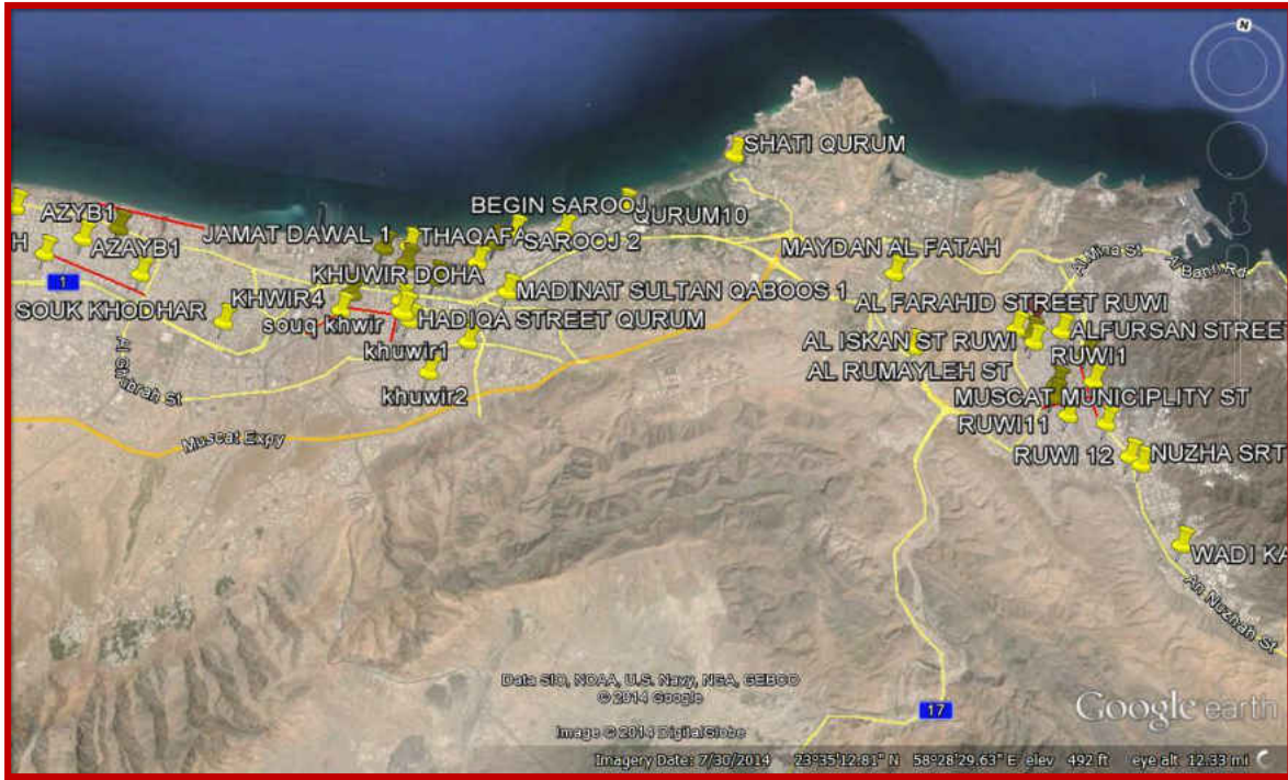
Figure 3-3: Google Earth Map for Muscat Segments

The data sets contained several variables: segment length, AADT, driveway density, speed limit (mi/h), and median width (ft). Finally, the collision data, traffic volume data, and cross-section road features were merged in one file. The resulting database contained information about the collisions occurring on each segment together with the geometric and traffic characteristics of this segment. The segmentation process resulted in 104 homogeneous segments for the entire City of Muscat with the length ranging between 0.12 mi and 1.8 mi and an average of 0.48 mi.