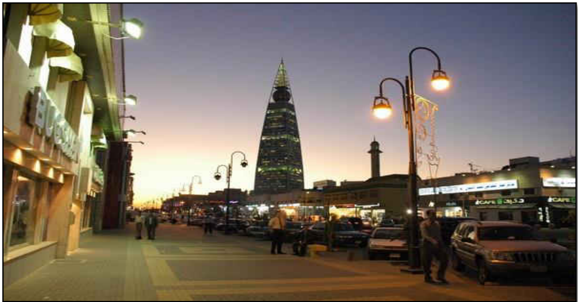
Figure 1-1: Urban roadway in Riyadh with angle parking

The original contribution of this study to the state of the art is quantification of the impact of angle parking factors on crash severity in Riyadh; the application of HSM models to the prediction of crash severity in the city of Riyadh using Riyadh local crash modification factors compared with HSM default values; and the crash severity prediction performance comparison among three statistical models, HSM models, new local NB models, and new local transferable model from neighboring GCC country.