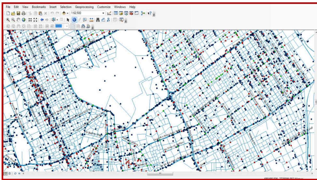
Figure 3-1: Riyadh ARC GIS map

successfully and the municipality is now utilizing the system with its Arabic user interface for planning, engineering, and management activities. The City of Riyadh currently uses a GIS to manage, analyze and display data. The observed crash data were obtained from the HCDR files and ARC GIS map shown in Figure 3-1, provided by the Riyadh Municipality. The crash data for road segments and intersections were collected separately.