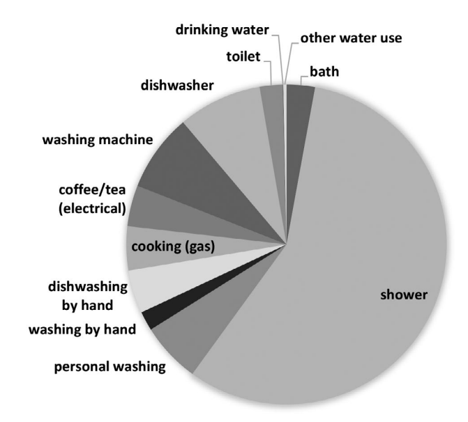
Figure 2. Energy for water in Dutch households.

use) are combined with water use, the energy requirement for municipal water supply and use in the Netherlands lies between 9.6 and 10.2 GJ per capita per year. When the higher value for water supply from Frijns et al. (2008) is taken, 9.3 GJ (92%) is energy used by households to heat water, 0.6 GJ (6%) for water supply, and 0.2 GJ for water treatment (2%). The energy requirement for heating water is dominated by the shower (on average 5.5 GJ per capita per year), the dishwasher (0.8 GJ per capita per year) and the washing machine (0.7 GJ per capita per year). Energy for heating the rest of the water in a Dutch household (washing, dishwashing, cooking, and preparing coffee and tea) is 2.3 GJ per capita per year. Figure 2 shows the relative energy use per household function. The top three energy requirements are for water for the shower (58%), water for the dishwasher (9%) and water for the washing machine (8%).