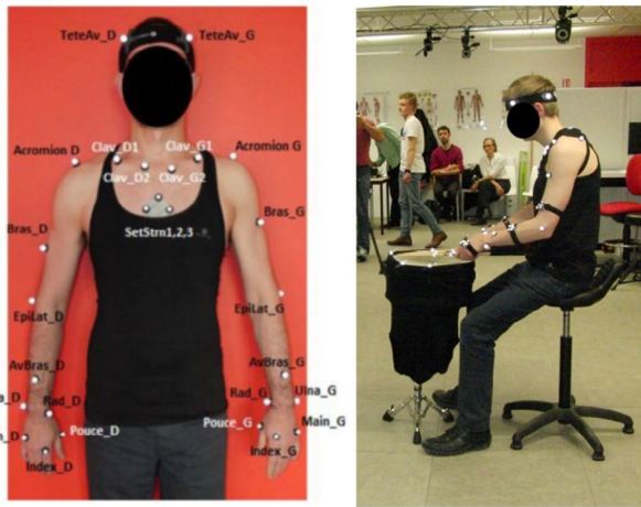
Figure 1. Motion capture marker set and session.

demonstrated a lesser ability to reproduce their strokes in a constant manner: both stick elevation and timing between each stroke showed a wider range of realisations, indicating a lower control on stick movements. The fact that advanced and expert musicians scores are grouped around or just below a 5% CV, could also indicate that there is a threshold delimiting a sufficient level of control to perform at professional level.