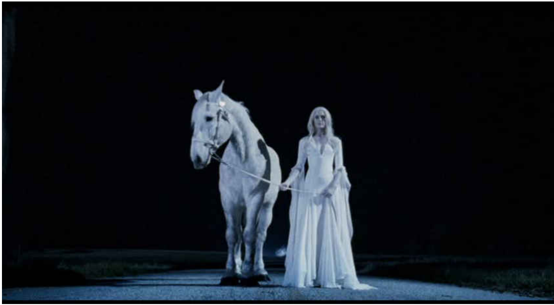
Figure 8 Michael's vision of his mother from Halloween II (2009)