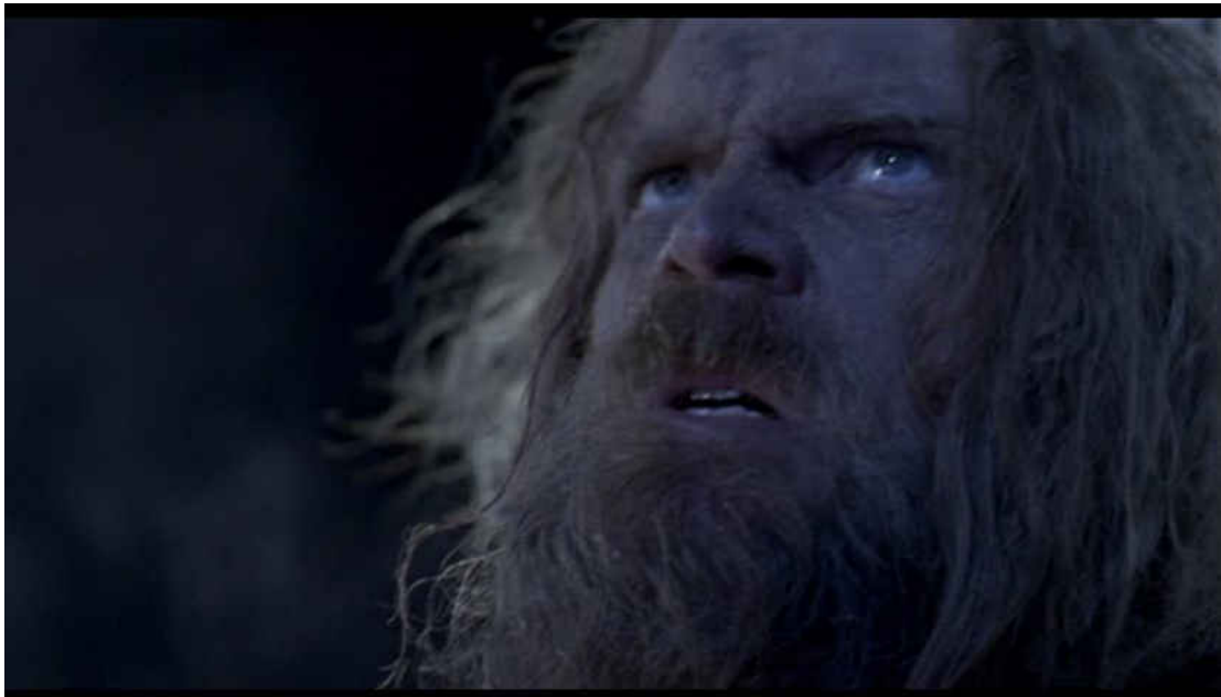
Figure 5 Actor Tyler 'Big Sky' Mane as Michael Meyers in Halloween II (2009).