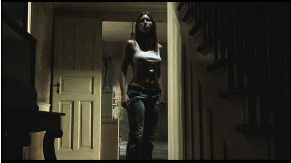
Figure 3 Sexualized cinematography and mise-es-scène in The Texas Chainsaw Massacre (2003) – Erin's costuming and top highlighting