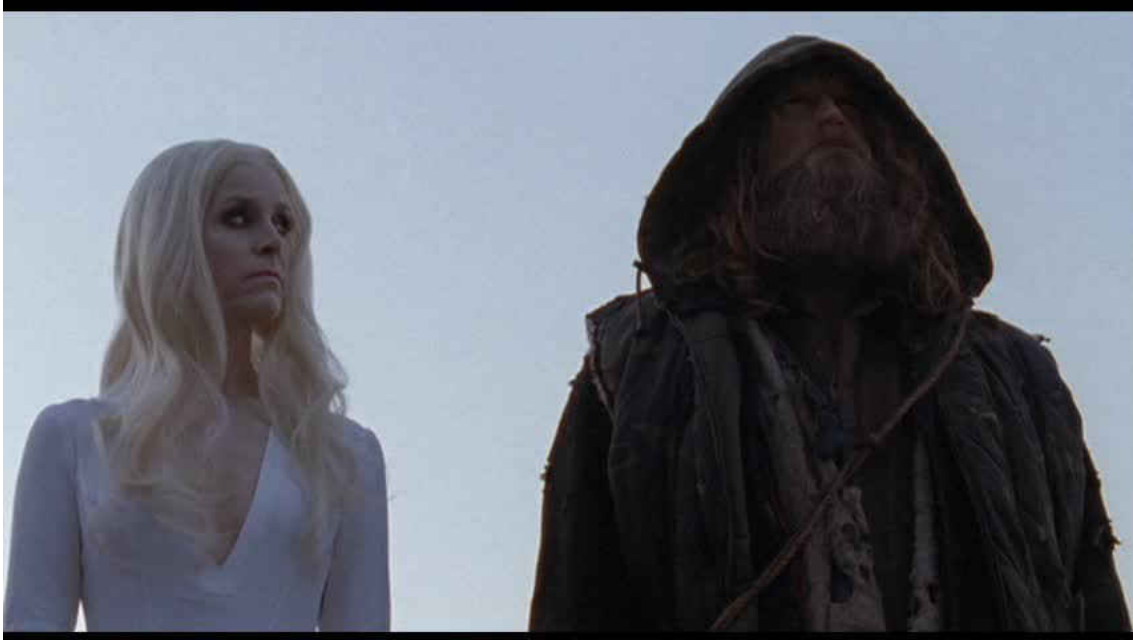
Figure 7 Michael and his (hallucinated) mother in Halloween II (2009)

anyone along the path to finding his sister, so too does Laurie begin to envision her birth mother proud that Laurie has finally accepted her role within the family dynamic.