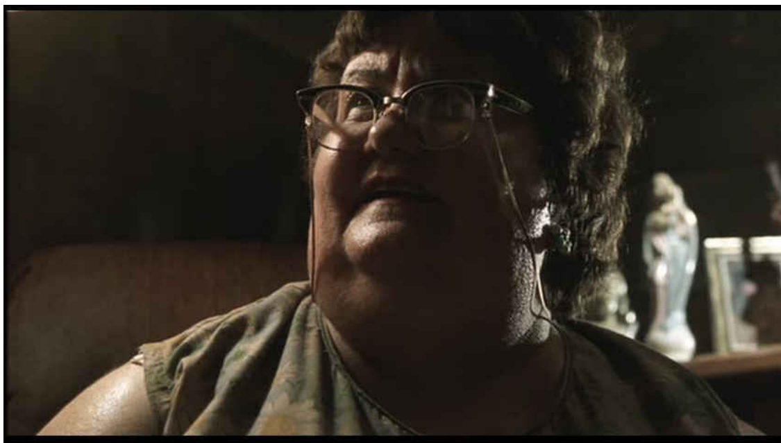
Figure 2 Two versions of the bad mother in The Texas Chain Saw Massacre (2003) – the obese mother