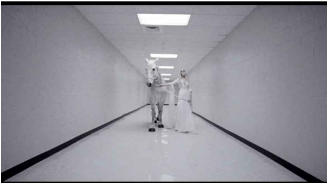
Figure 11 The reverse shot of Mrs. Meyers from Halloween II (2009)