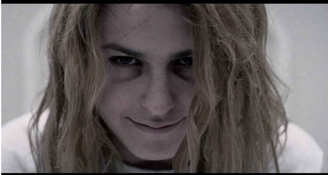
Figure 10 The final shot of Laurie from Halloween II (2009)