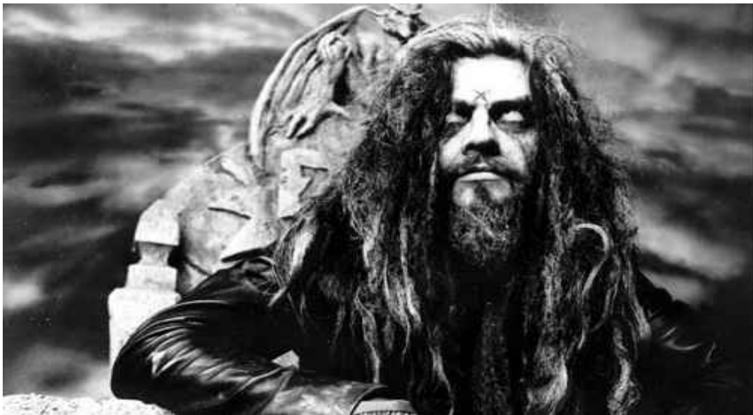
Figure 6 A publicity still of director Rob Zombie before a tour with his band in May, 2005. 3