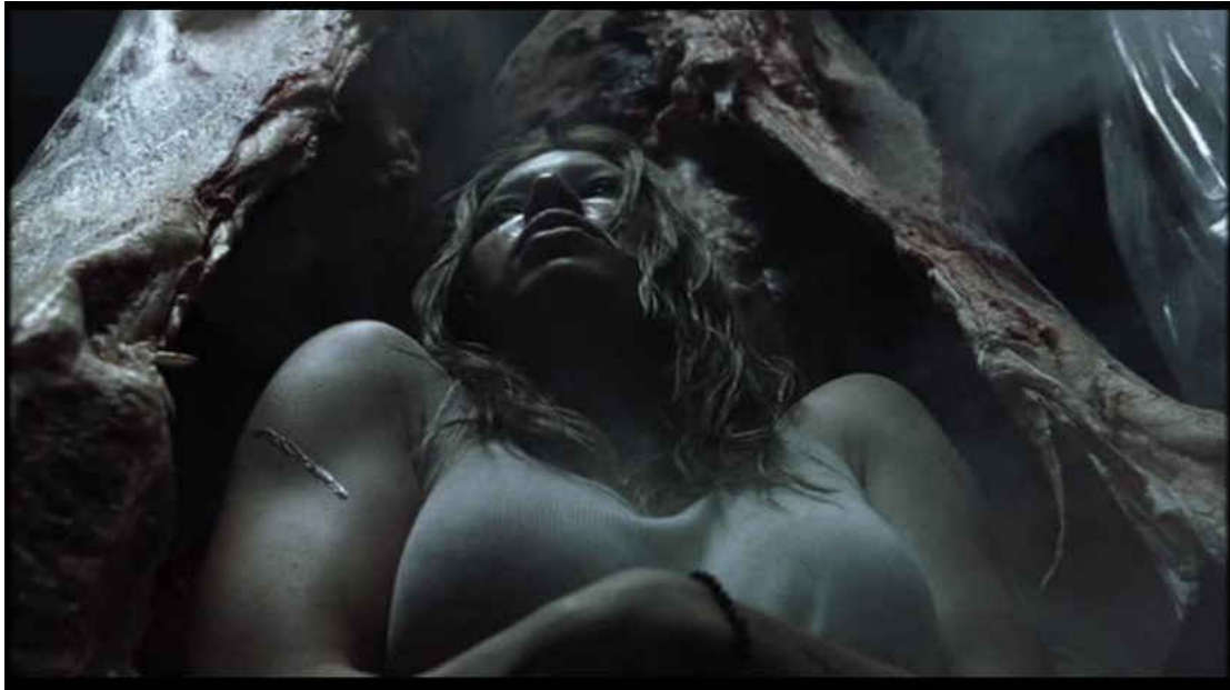
Figure 4 Sexualized cinematography and mise-es-scène in The Texas Chainsaw Massacre (2003) – Erin's low-angle shot in the meat locker