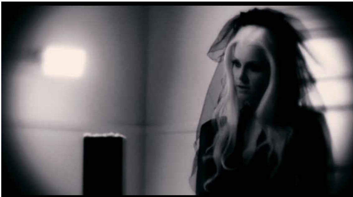
Figure 9 Laurie's vision of her mother from Halloween II (2009)