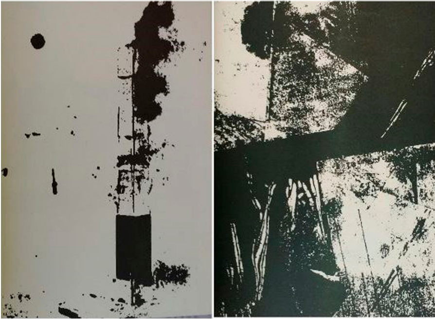
Figure 2. 'Untitled' by Bob Cobbing and John Latham in Group H (London: Writers Forum, 1969), a booklet issued at the time of Group H's thirty-sixth exhibition held at the Drian Galleries, October 1966. Reprinted with permission of the Cobbing family.

events they participated in, starting with the 36th exhibition of Group H (October 1966) held at the Drian Gallery. 7 This event is of interest for three reasons. Firstly, works by Latham and Cobbing are featured in the catalogue which accompanied the exhibition (Figure 2). In this form and on pages reproduced with a duplicator, striking aesthetic similarities emerge between their work. Both poet and artist present wordless monochromatic visual pieces which are left untitled. Black sprays of paint (in Latham's case) and black splatters of ink (in Cobbing's) are presented on otherwise white pages, with Latham's artwork displaying a more pared-down aesthetic. A second edition of the catalogue was printed in 1969 and was circulated independently from the exhibition on what was essentially a poetry list. In this form, they both appear as page-based artists working through seemingly similar aesthetic concerns, perhaps related to the 'dirty' concrete poetry for which Cobbing and Writers Forum became well known. The catalogue's reproduction and distribution invites this conflation, and an aesthetic similarity is highlighted that would otherwise have been obscured due to the variety of both men's practices. It is often noted that Latham's artworks are not easy to place within wider narratives of contemporary art. Abstract but figurative, conceptual but also deeply concerned with gesture