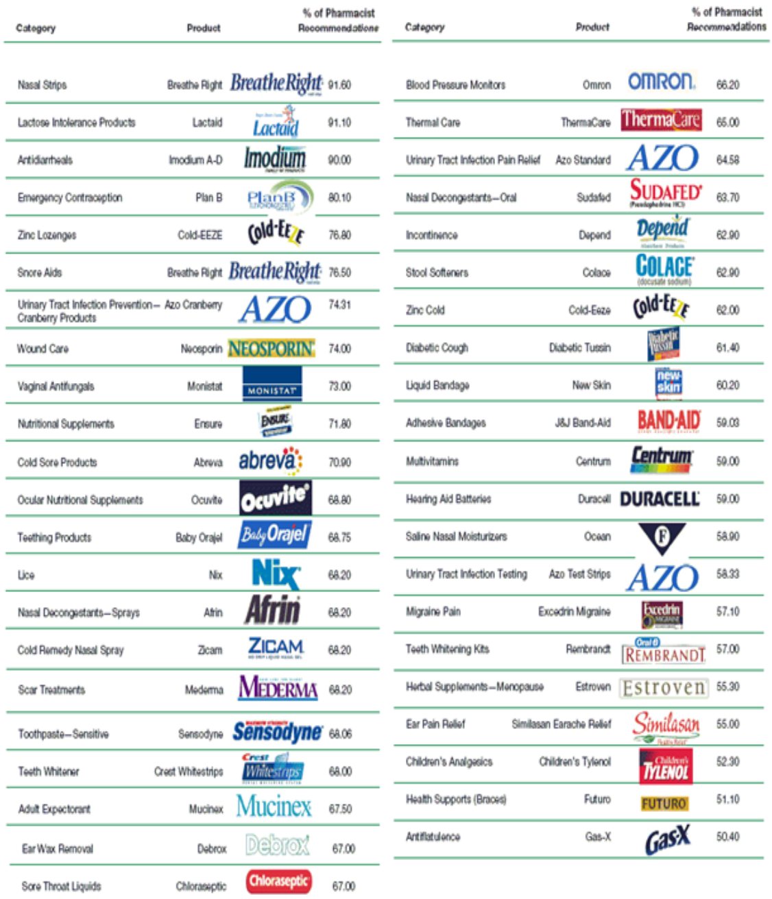
Figure 2-3. Preferred Over-the-counter brand recommendations of pharmacists