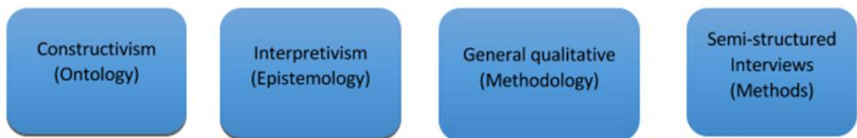
Figure 2: Philosophical foundation underpinning the study

The graphic represents the directional decisions I made in constructing this research. My ontological stance is from a constructivism mindset, where I understand the world through building and creating experiences. To further examine my interest in principals' instructional leadership work, my epistemology is interpretivism, where experiences are interpreted. The use of a general qualitative methodology is an appropriate approach which incorporates semi-structured interviews as a method.