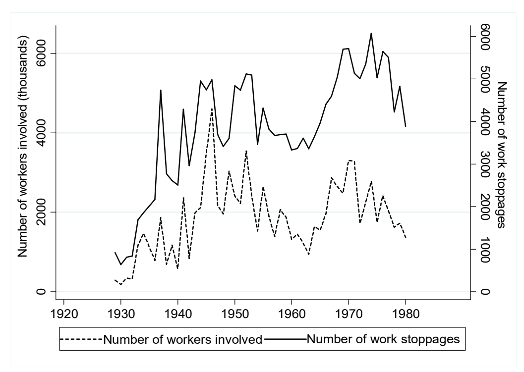
Figure 1. U.S. Work Stoppages, 1929—80

the period of concern, the average annual participation rate in work stoppage remained as high as 4.5%, which was considerably higher than the 3.7% from 1927 to 1945 and the 2.9 percent from 1960 to 1979. Similarly, idled days due to work stoppages amounted to 0.28% of the estimated total days spent productively in the United States from 1947 to 1959, which was higher than the 0.15% from 1939 to 1945 and the 0.19% from 1960 to 1979.<sup>73</sup> The period between 1947 and 1959, therefore, was marked by substantially higher rates of industrial conflict compared to the periods before and after it.