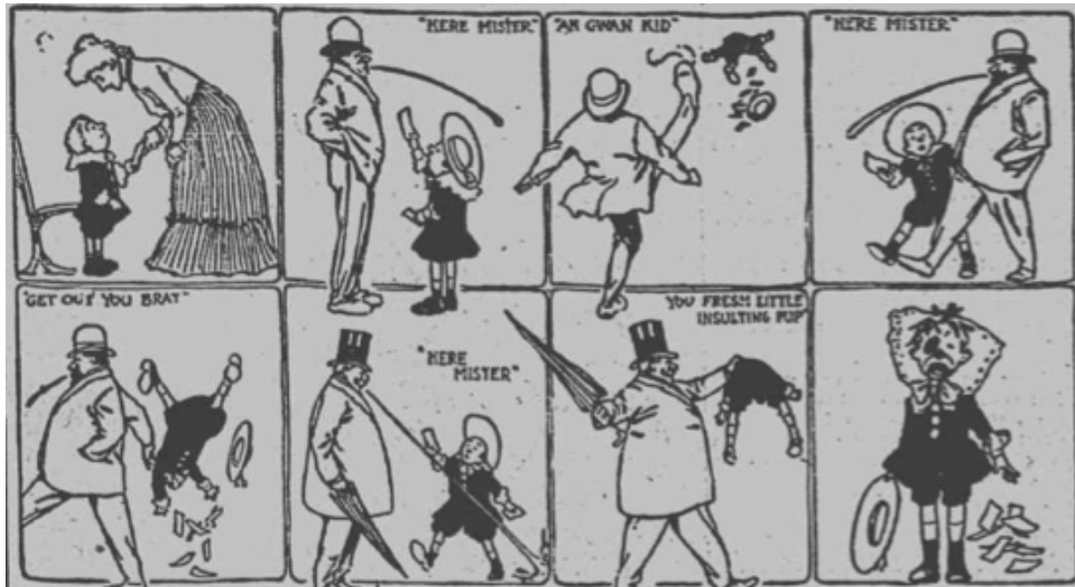
A cartoon in New York's Evening Telegram illustrated the potential dangers of children's enforcing anti-spitting ordinances. 61

each case a great puddle of spit remains and the boy is finally left tearful, beaten, and bloodied, with a pile of anti-spitting cards by his feet. 60