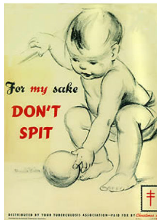
A poster produced by the National Tuberculosis Association depicted vulnerable children as the ultimate victims of spitting. 51

Perhaps the most common theme of all anti-spitting propaganda, however, was children. Because children represented the community at its most vulnerable as well as the very future of American society, they encapsulated all of the ideas inherent in other propagandistic messages. It became easy for anti-spitters to depict their nemeses as undeserving of consideration when displaying pictures of or explaining the vulnerabilities of children. For that reason, anti-spitting literature and propaganda is rife with depictions of vulnerable and innocent children. Some groups, like Indiana's Marion County Tuberculosis Association, used simple but penetrating slogans such as "Save the Children – Don't Spit." 49 In a postcard the was distributed in the pay envelopes of 25,000 industrial workers in Syracuse, New York, the city's health commissioner asked if citizens would not "Help protect the children" by spitting into toilets, rather than on sidewalks. Others relied on images of children, such as a National Tuberculosis Association poster that featured a small boy walking along the sidewalk and the slogan, "For my sake – Don't Spit!" 50 Another NTA poster carried the same slogan but included a picture of an infant innocently playing with a ball.