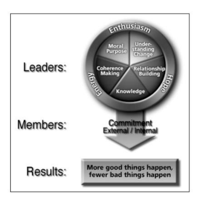
Figure 1. A Framework for Leadership (Fullan, 2001).

The theoretical framework reflects a theory of leadership development that is centered on enthusiasm, energy and hope (Fullan, 2001). This framework is identified as a theory of human development that focuses on a small number of core aspects of leadership that can assist in developing a new mind set. As a result, Fullan's leadership framework will assist teachers and leaders in addressing and possible changing the way in which they perceive reform initiatives. Leaders are encouraged to be enthusiastic, hopeful and energetic as they focus on five dimensions of leadership: moral purpose, understanding change, relationship building, knowledge building and coherence making. A brief description of each dimension of leadership as perceived by Fullan follows.