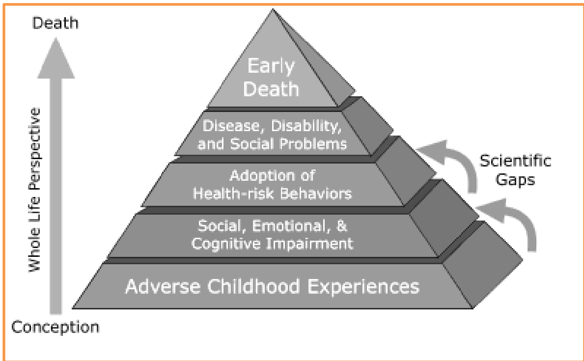
Figure 1. ACEs and related health outcomes over the lifespan (Anda et al., 2004).

All study participants were adult enrollees in the Kaiser Permanente Health Maintenance Organization. Participants had average of 14 years of education, and the sample included comparable numbers of males and females. This study highlights the prevalence of ACEs in the general population of middle-class, educated, working families. More than half of the respondents reported at least one, and one-fourth reported two or more ACEs. Because of the prevalence of ACEs in the general population, one can generalize that ACEs are also prevalent in the community college student population and may be a contributing factor in a student's failure to progress or complete community college programs. In fact, community college students may harbor higher ACE scores because community colleges serve large proportions of students who live in poverty (American Association of Community Colleges, 2013), one factor related to high ACE scores (Porter, 2010).