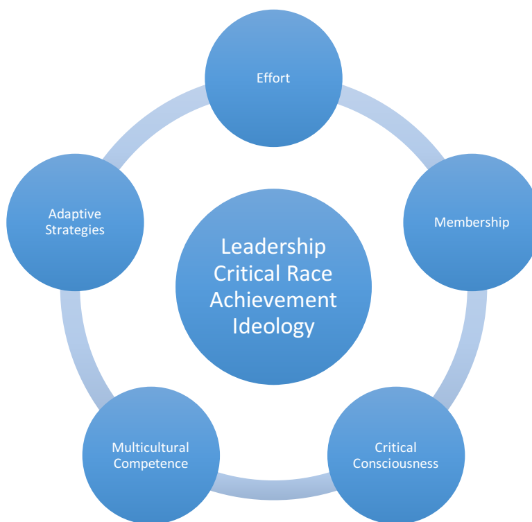
Figure 1. Leadership Critical Race Achievement Ideology framework and tenets (Carter, 2008).

and how they compare and contrast with an achievement ideology rooted in social justice. Furthermore, this study sought to understand how leaders conceptualize achievement, and how these conceptualizations related to a leadership critical race achievement ideology. Finally, the purpose of this study was to understand how these conceptualizations affected their practice as school leaders. A leadership critical race achievement ideology was adapted from Carter's (2008) framework initially designed for students. Figure 1 represents the framework and tenets used for this study. This framework allows leaders to develop equitable schools while helping students of color understand that achievement is a part of their racial identity and not separate. This study focused on school leaders that serve high populations of minority students. The goal of this study was to discern school leaders' achievement ideologies and how these leaders operate within these ideologies. Finally, the goal of this study was to see if these ideologies function within, similarly, or differently from a leadership critical race achievement ideology.