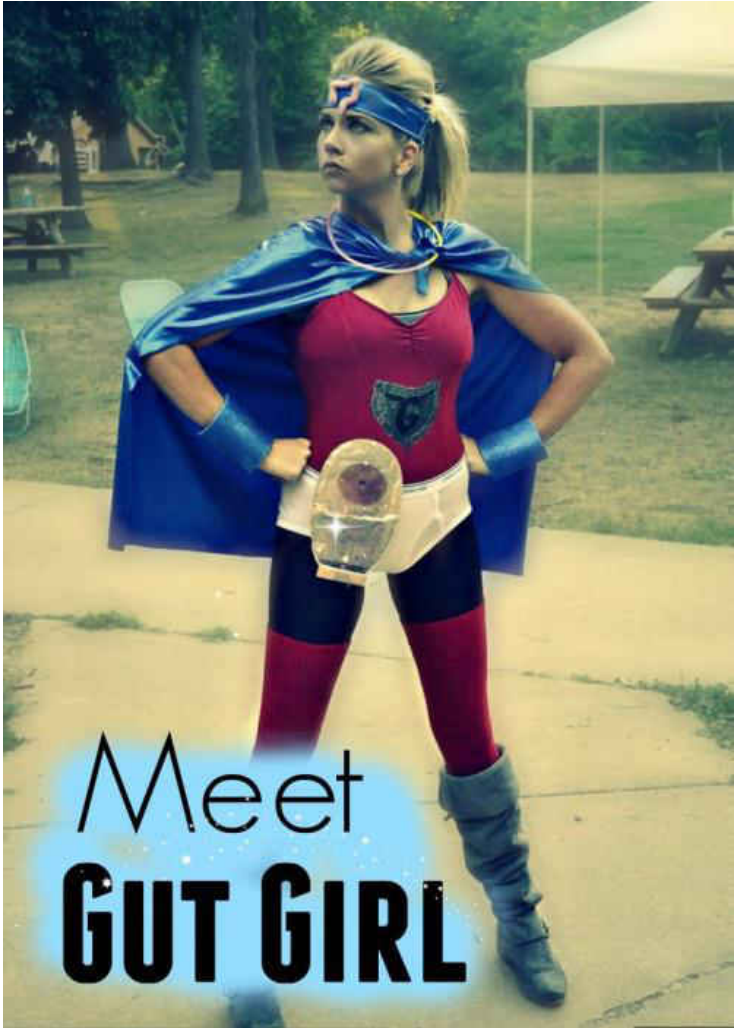
Figure 4. Gut Girl, the IBD superhero is pictured here displaying her superhero armor fully equipped with an ostomy pouch.

Taken together, these cases demonstrate certain intra-actions, particularly involving positive experiences with the ostomy, in which the ostomy and self become cyborg self.