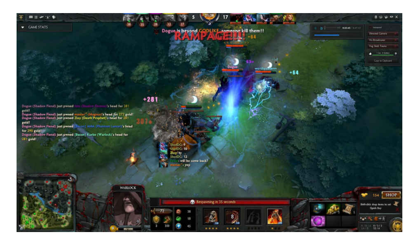
Figure 3 Valve's MOBA Dota 2

While the popular MOBA Defense of the Ancients 2 (Valve 2013-Present) freely offers all heroes for player adoption, other studios have crafted a new business model for the genre. Within this structure, players unlock heroes either by paying real-world money for them, or earning enough in-game currency through play to unlock them. The most notable game using this business model is Riot Games' League of Legends (2009-Present)<sup>3</sup>. Games like League of Legends alter the MOBA formula by restricting access to certain forms of gameplay. While players may slowly unlock characters by playing and saving their earned currency, the most immediate means of access occurs by purchasing them with real-world money. This model of paying to unlock content has spread throughout the computer game industry.