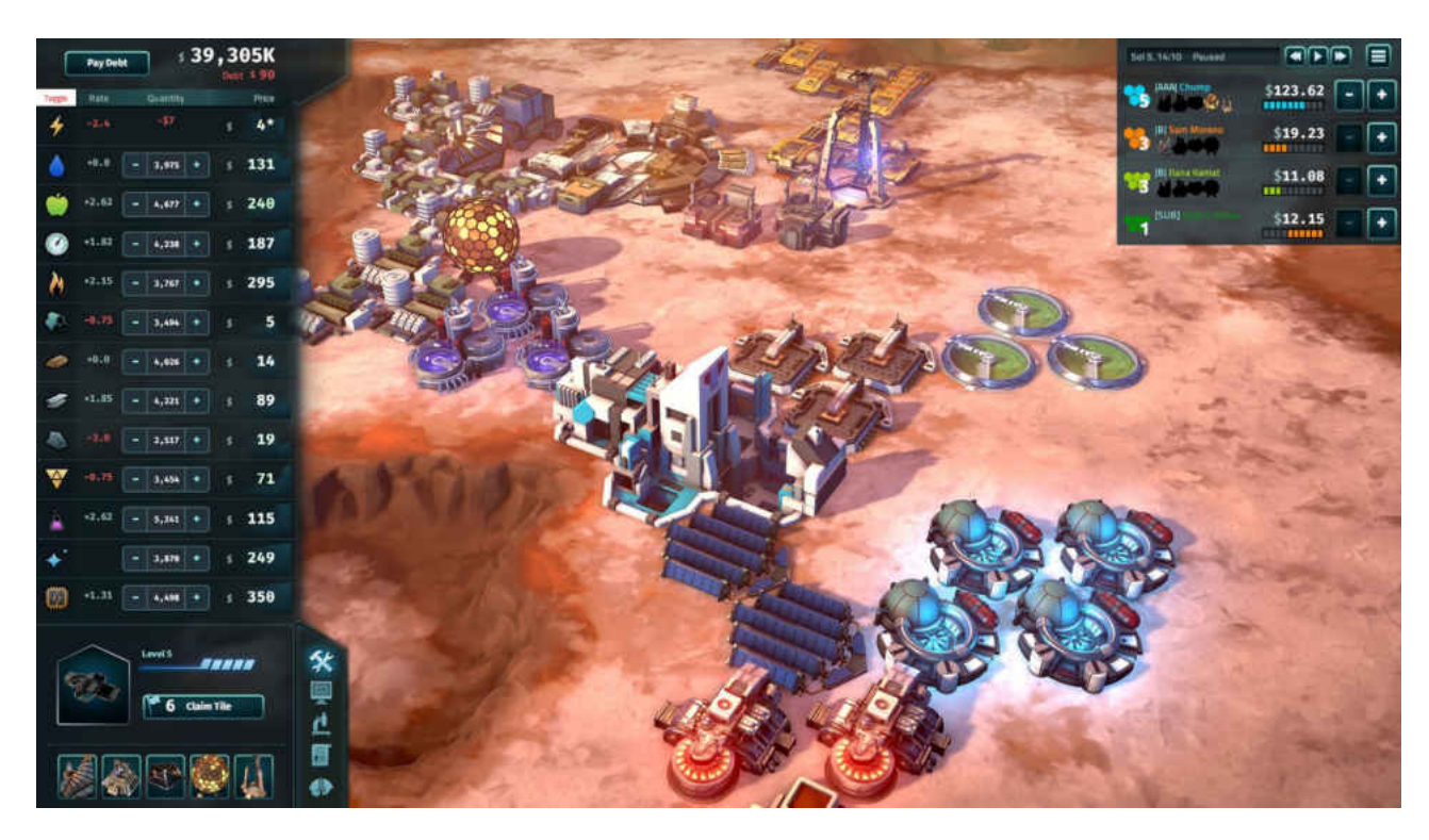
Figure 1 Offworld Trading Company

With this information in the interface (Figure 1), OTC encourages players to use the financial information on display and make decisions based on the position their opponents are taking in the market, rather than on the map. Moving the conflict of the strategy game from the map to an indication of market activity situates the main conflict of the game in the business arena. Most sessions and missions of OTC feature a similar pattern of resource collection, company development, and market manipulation. Players begin by acquiring natural resources from tiles near their headquarters, which they use to construct factories and produce commodities. Water, aluminum, iron, silicon, and carbon can be harvested, while power, chemicals, food, fuel, glass, oxygen, and steel must be produced. The game also allows players to buy and sell resources via the market accessed via the interface. As players engage in the market, it responds with fluctuating prices, which gives other players an opportunity to try to manipulate the prices of various resources.