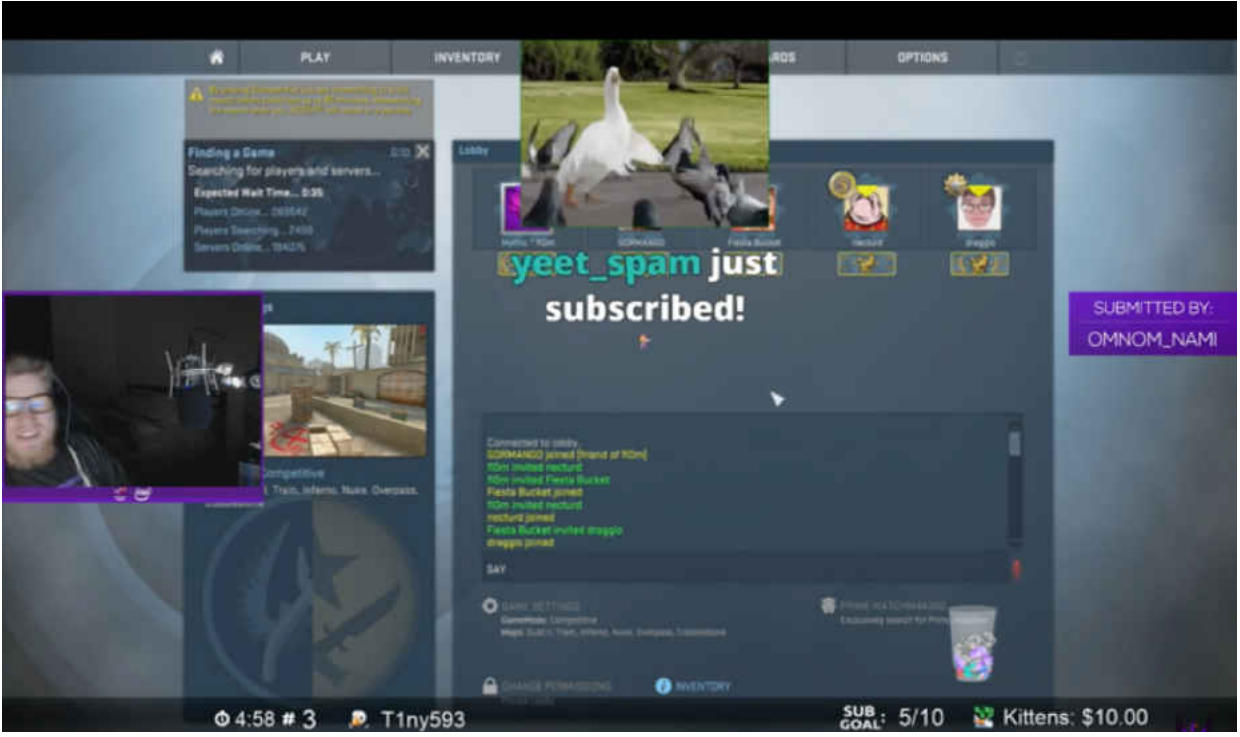
Figure 4 flOm's Twitch Stream

While there is no fixed visual arrangement for a Twitch presentation, a number of conventions have developed over the service's brief history, and the rhetoric of these interfaces