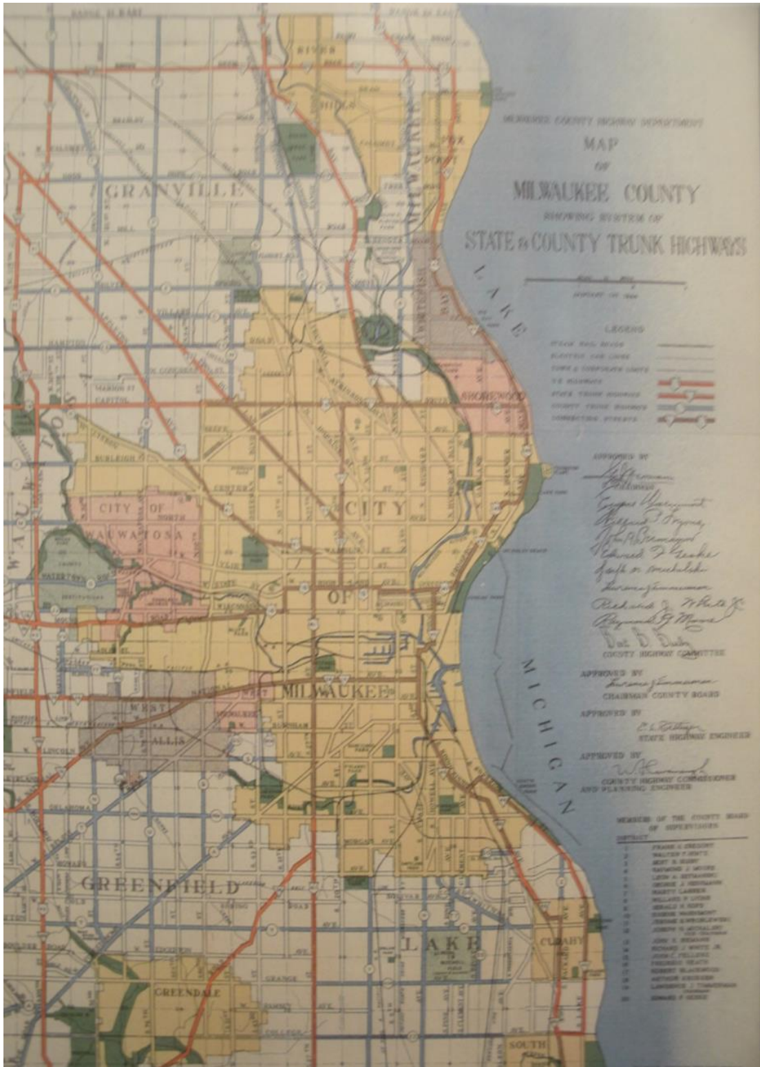
Figure 1: As of 1944, Milwaukee's borders extended north to Silver Spring Drive and south to Howard Avenue. West Allis and Wauwatosa were also significantly smaller. 49