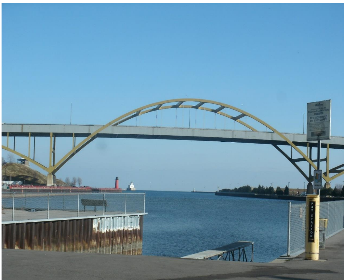
Figure 10: A bridge spanning the harbor finally opened in 1977, nearly five decades after Milwaukee's leaders dreamed of linking downtown to Bay View and the South Shore.

This thesis has traced the story of Milwaukee's expressway system since its inception in 1946 through the end of the freeway construction era in 1977. It has tied Milwaukee into a national narrative and offered an insight into the thinking of road builders, civil engineers, urban planners, and elected officials. Perhaps that story and the background to regional transportation planning it offers will be used to inform future research.