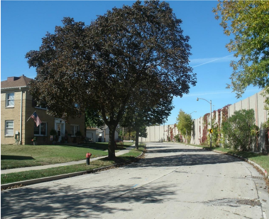
Figure 7: A concrete sound barrier separates I-43 from a residential neighborhood near South 5 th Street and West Warnimont Avenue.