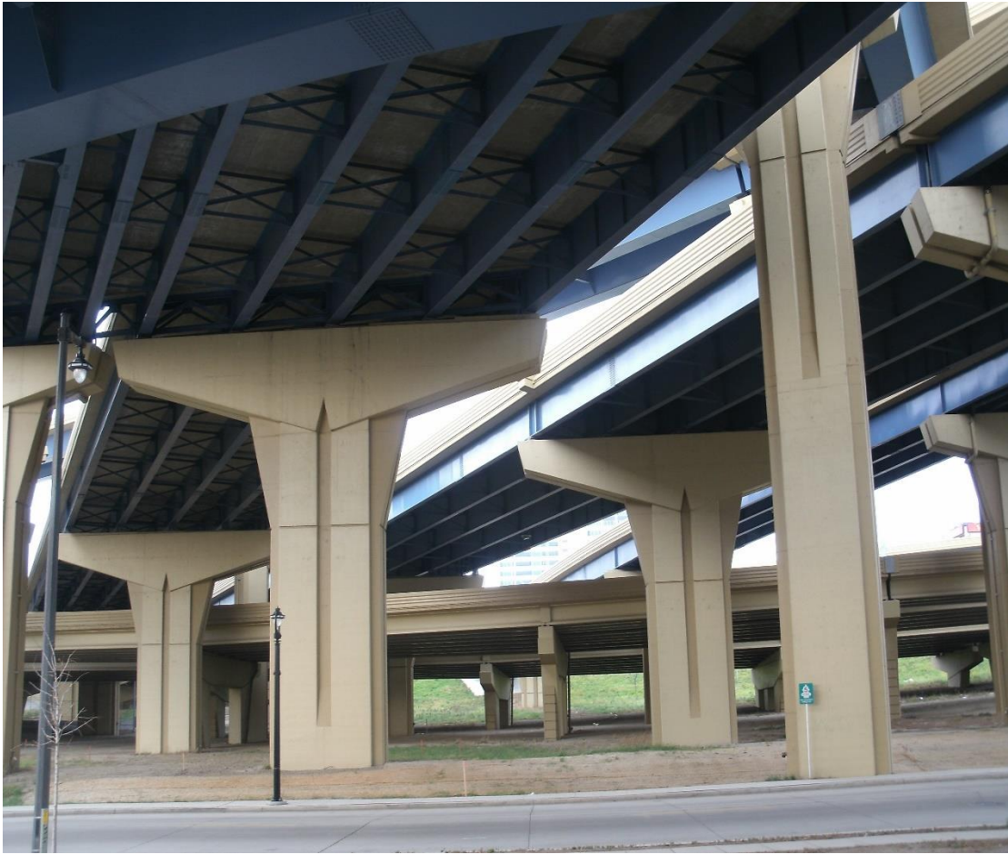
Figure 8: This is a view along West St. Paul Avenue under the Marquette Interchange.