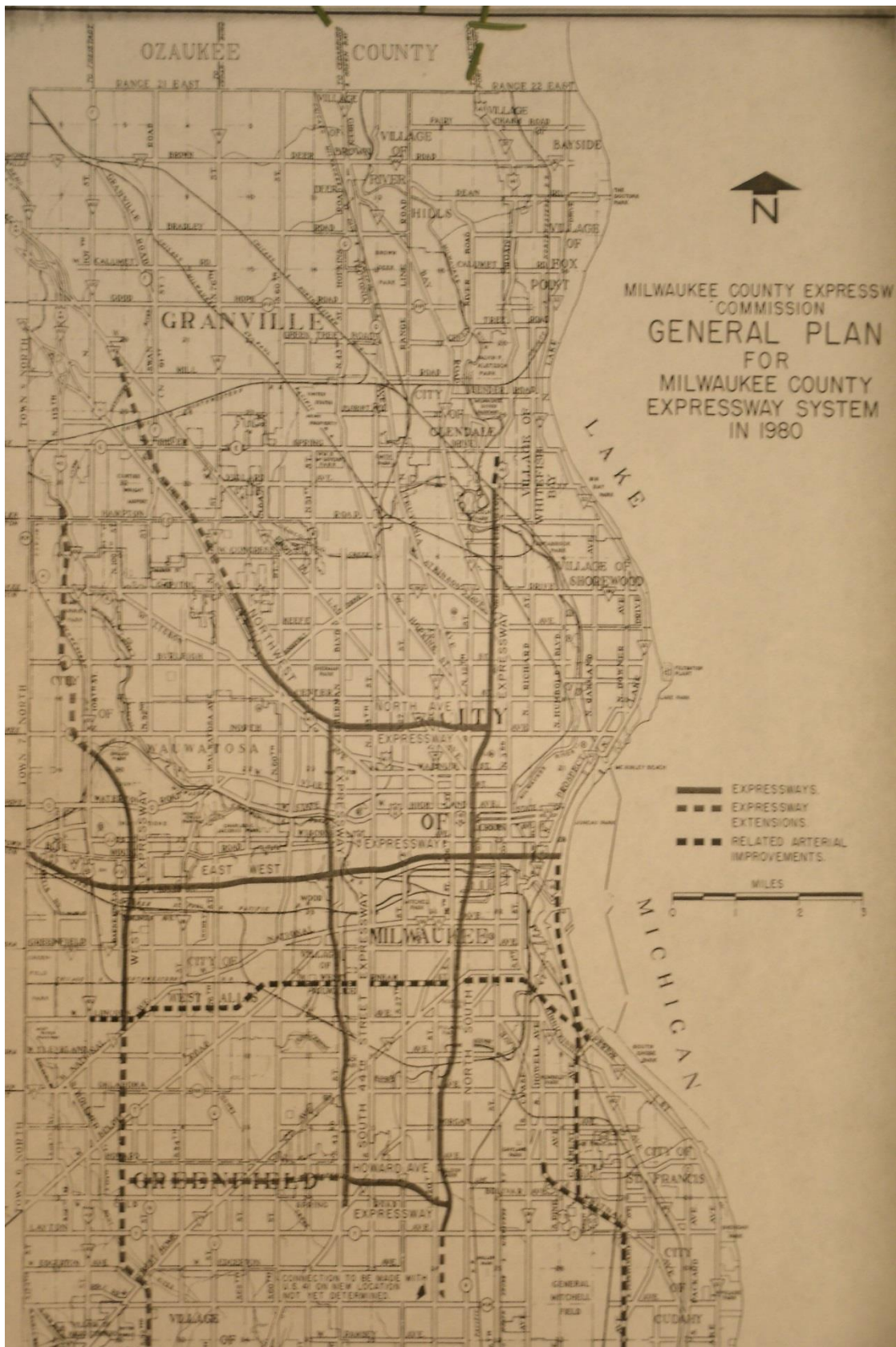
Figure 3: The 1955 General Plan for Expressways in Milwaukee County, proposing expressways to be built before 1980. 18