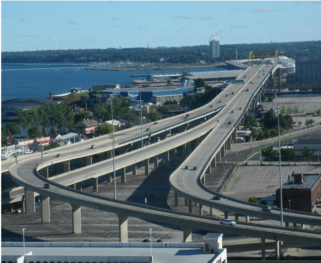
Figure 9: The Lake Interchange and I-794, facing south.

In 1974 the Expressway Commission cancelled the extended Stadium North Freeway, although County Executive Doyle continued to support closing the gap between the Fond du Lac Avenue and Stadium Freeways. Eighteen anti-freeway legislators including future Mayor John O. Norquist also campaigned against more freeways, circulating a letter asking the governor to support their position. In January 1977, Governor Patrick Lucey ordered a halt the Stadium South Freeway. 143