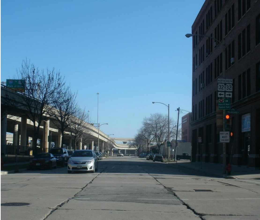
Figure 5: I-794 in the Third Ward along East St. Paul Avenue at North Milwaukee Street, not far from the former site of Our Lady of Pompeii Catholic Church. Photo by Greg Dickenson, 2012.

its building at 1010 West Wisconsin Avenue in January 1966. 81