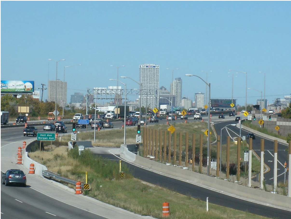
Figure 4: A view toward downtown from a pedestrian bridge over I-43 at West Warnimont Avenue. Photo by Greg Dickenson, 2013.

governments. After that happened, there was still significant debate and discussion. That narrative will be explored in the concluding chapter of this thesis.