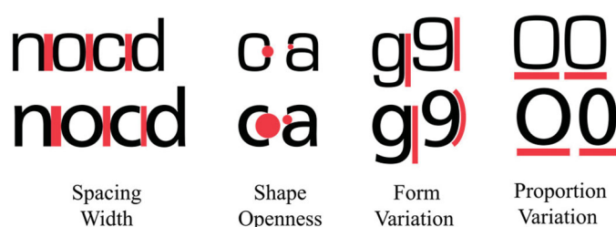
Figure 1. Samples of two typefaces we evaluated. Eurostile (top row) and Frutiger (bottom row), illustrate their key design differences. Eurostile's tight spacing, closed letter shapes, and highly uniform contours and proportions contrast with those of Frutiger. The at-a-glance legibility methods described here can test the performance characteristics of each. Figure adapted from Reimer et al. (2014).

need to rely on subjective opinion and all of its many complexities.