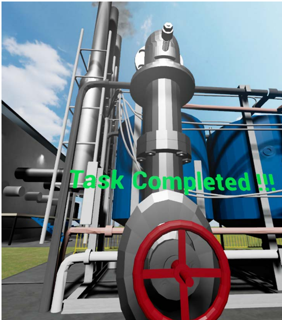
Figure 4. Completion of the EPR assessment. Note: EPR = emergency preparedness and response.

effectiveness of the evacuation and mitigation exercises, we hypothesize the following.