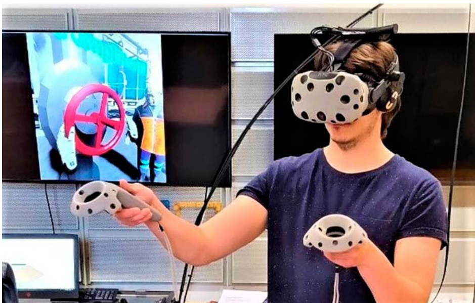
Figure 3. A participant closing the main gas valve to arrest the fire hazard.