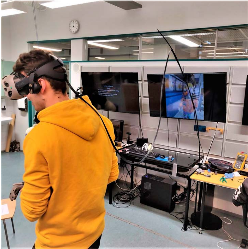
Figure 2. A participant evacuating the power plant at the onset of fire.