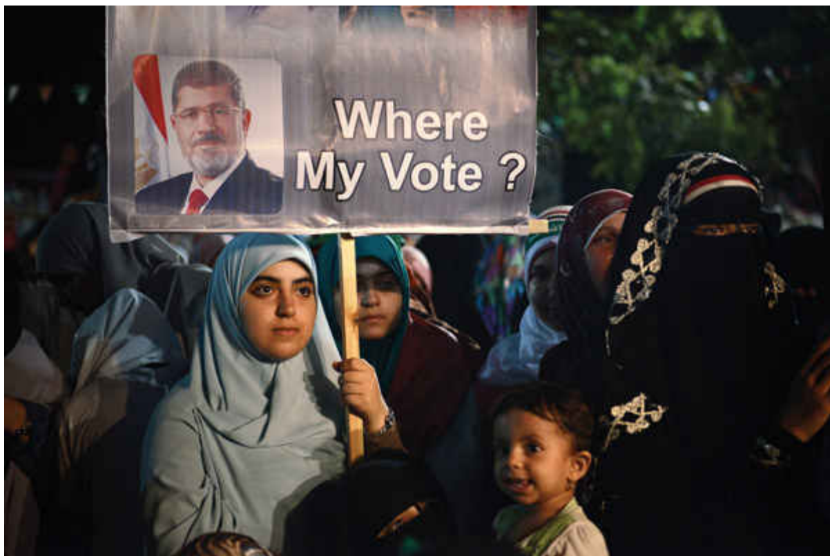
Figure 6. Supporters of Egypt's deposed President Mohamed Morsi outside Rabaa al Adawiya mosque in Cairo, on the eve of Eid al Fitr, August 7, 2013. 175

The following pictures show us examples of how Islamist women supported democracy and condemned the military coup, and what happened to them when they denied the military takeover.