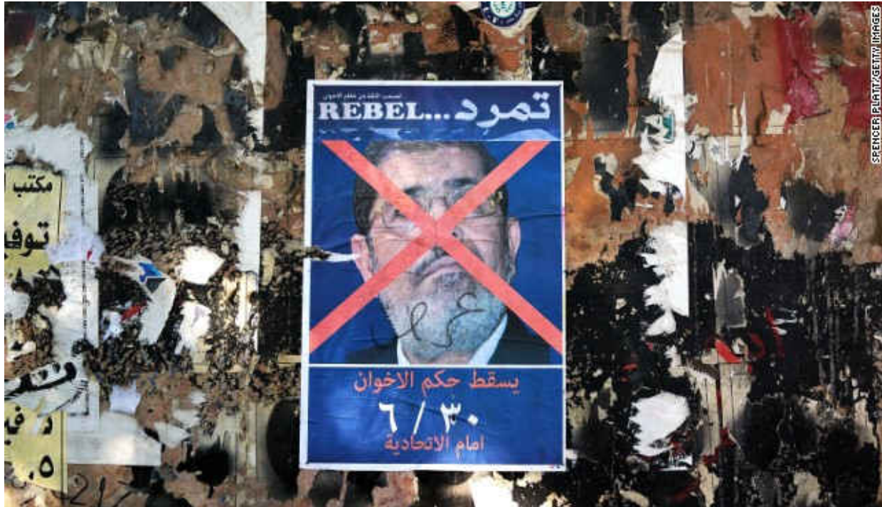
Figure 4. An anti-Morsi poster is displayed on a wall in Tahrir Square on July 3, 2013. 168

that they collected more than 15 million signatures for a petition that calls for President Morsi to step down to allow for fresh presidential elections. 167