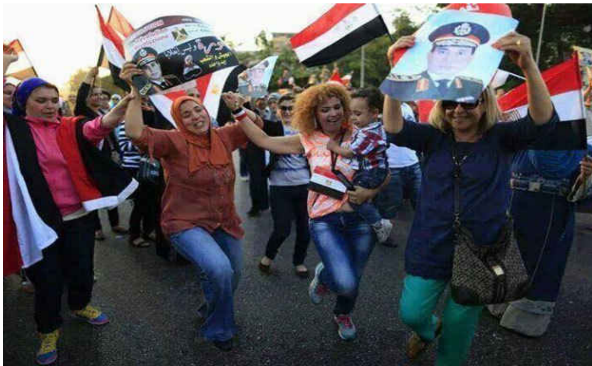
Figure 5. Supporters of Field Marshall al-Sisi carry his photos in an attempt to persuade him to run for the presidency. January 14, 2014. 174

In the following picture, we can see liberal women were singing and dancing in favor of the head of the military coup, general al-Sisi, who toppled the democratic elected president.