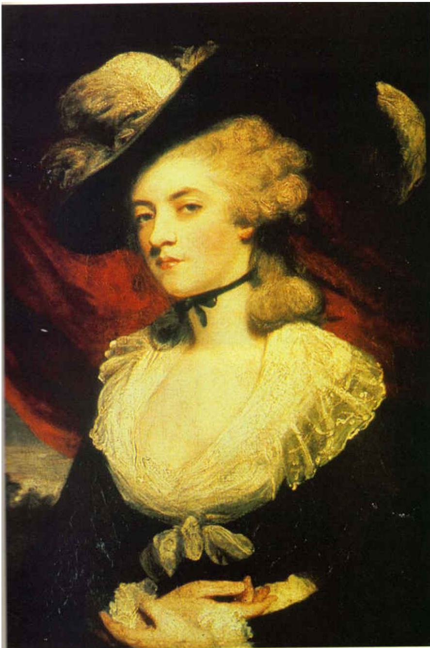
Figure 8 Mary Robinson by Sir Joshua Reynolds, 1782