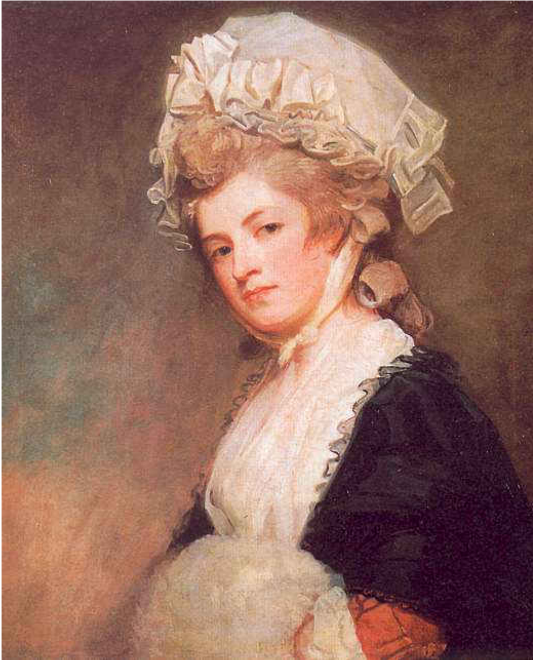
Figure 6 Mary Robinson by George Romney, 1781

appears as an older woman with skin still pure white and with cheeks still blushed with innocence (288). Ironically, as she sat for a portrait that depicted her as an innocent