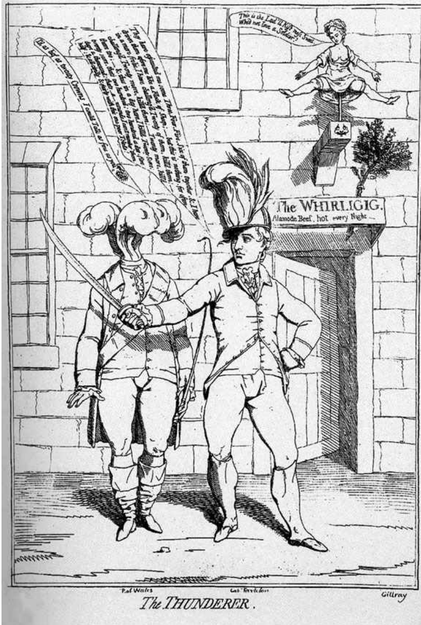
Figure 3 The Thunderer

Modern readers, unlike her contemporaries, may be quicker to read Robinson’s relationships with men of power as necessary means for self-security and self-promotion,