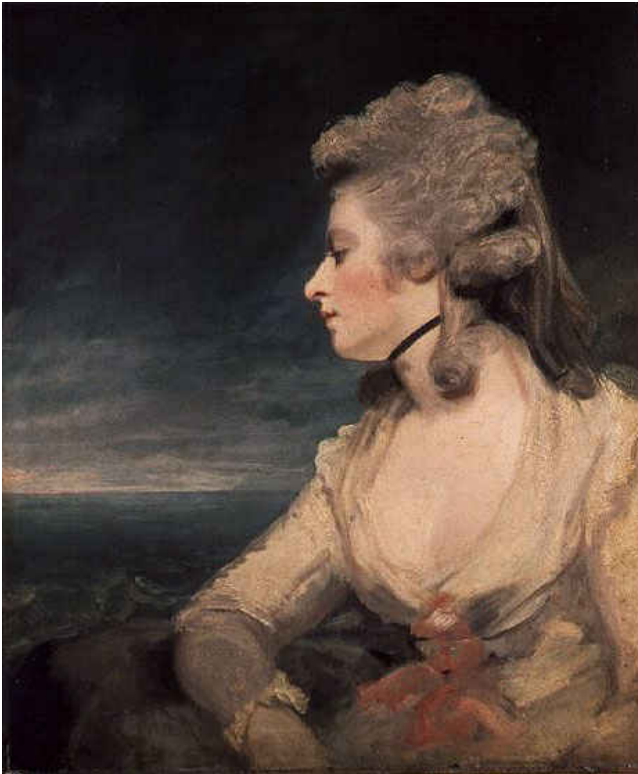
Figure 9 Mary Robinson by Sir Joshua Reynolds, 1784