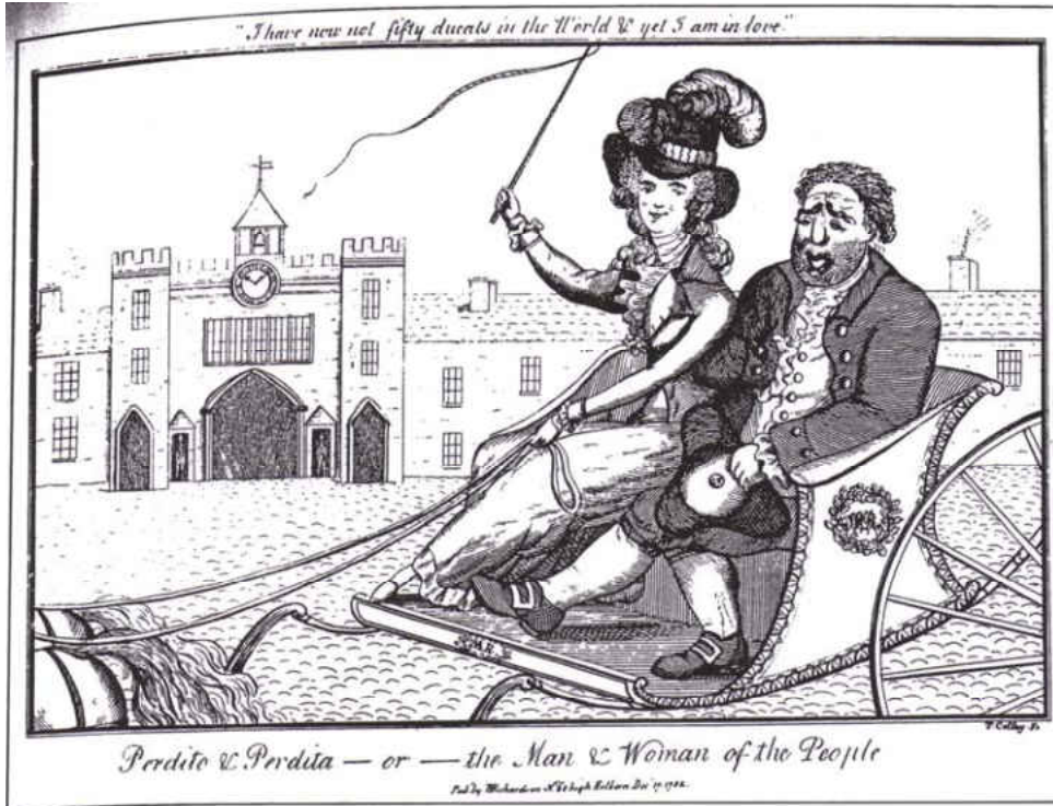
Figure 4 Perdito & Perdita