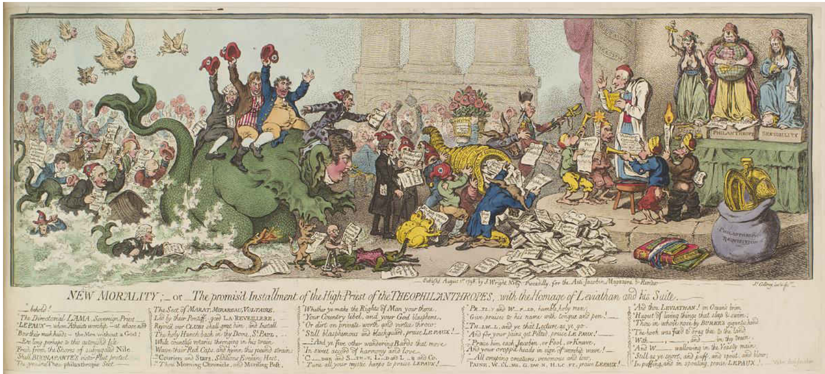
Figure 11a. “The New Morality.” James Gillray. Anti-Jacobin . 1798.