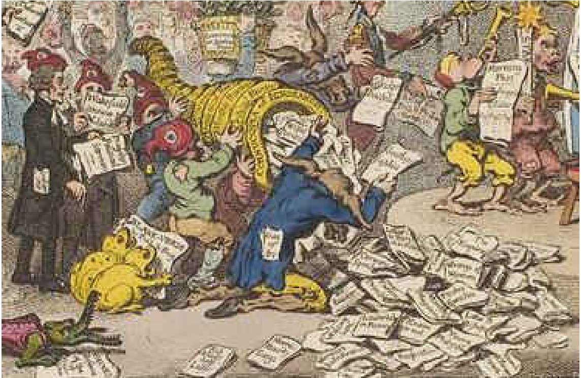
Figure 11b. Detail from “The New Morality.” James Gillray. Anti-Jacobin . 1798.