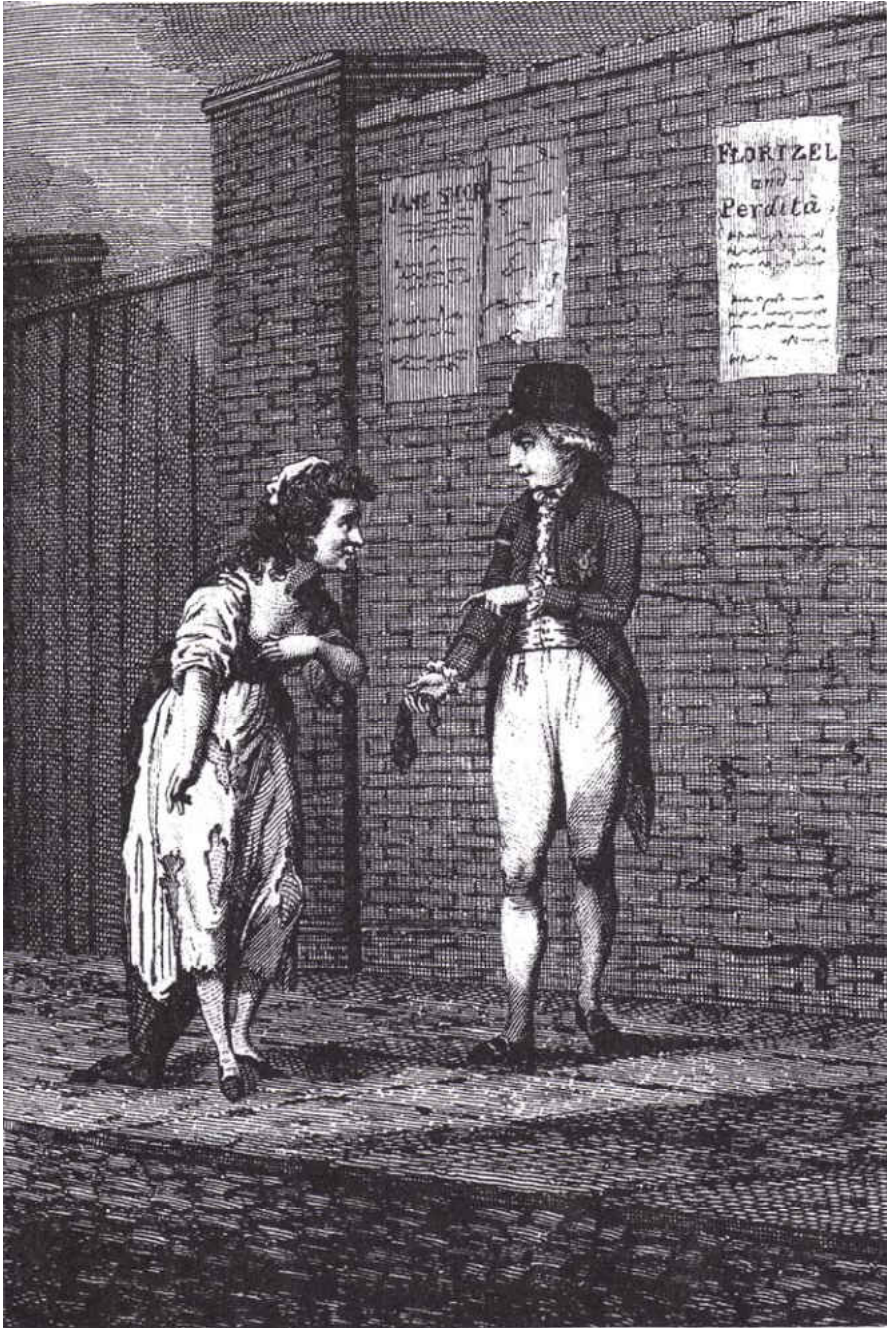
Figure 10 "Perdita Upon her Last Legs," 1784