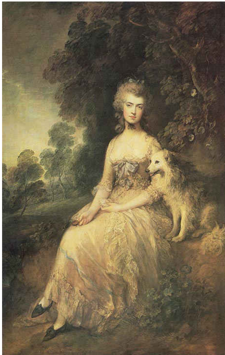
Figure 7 Mary Robinson by Thomas Gainsborough, 1782

miniature functions as a kind of forceful reminder” (Levy 154). Levy points to several key features in the portrait to support this interpretation of the painting. The miniature that she holds in the painting, Levy reasons, “is almost certainly meant to represent the Prince” (Levy 153). The miniature representing the Prince is in fact the one point on which all interpretations can agree. Levy argues that the placement of the miniature in