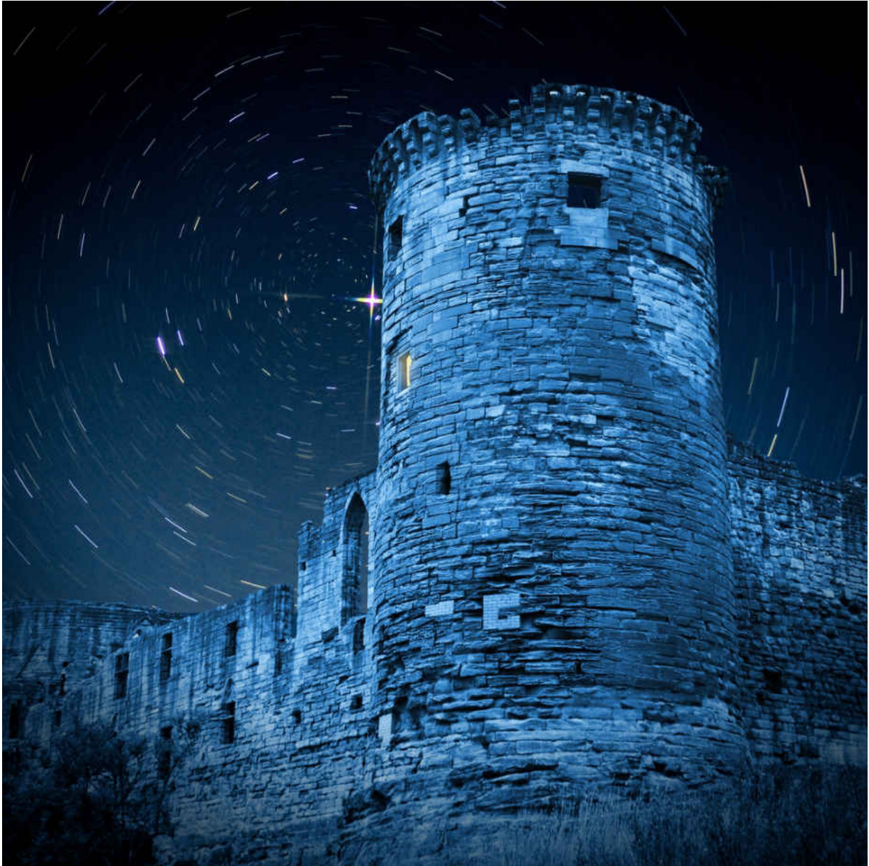
Fig. 3. This is Bothwell Castle (at Night) (2010) Xxxrmt