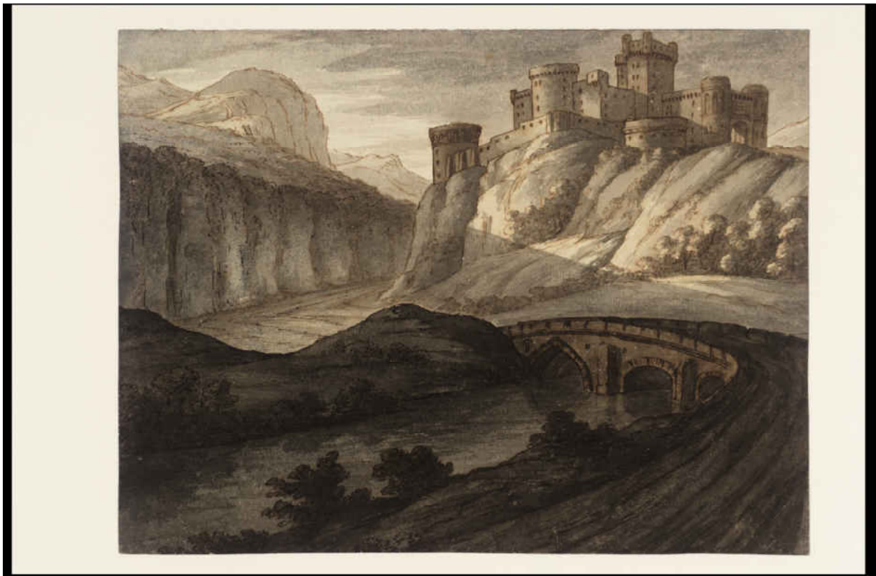
Fig. 1. A Castle above a River, among Mountains (n.d.) Scott, Frances (Lady Douglas)

Henchman” is an incredibly allusive text; these influences will be discussed in later sections of this introduction.