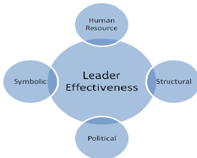
Figure 3. Graphic of Leadership Frames Adapted from Bolman and Deal (2008)

The first frame in Bolman and Deal's model, the structural frame, depicts those who are highly bureaucratic in their leadership roles. The structural framework provides stability for the organization through rules, policies, and a hierarchy of leadership. Leaders operating within the structural frame are task-oriented; these leaders define the goals of the organization and establish roles for people within the organization. As the organization evolves or becomes more complex, the leader may need to go from a top-down, vertical approach to structure to a lateral coordination that allows for more flexibility and personalization. In the structural frame, problems are solved analytically via restructuring of the organization or creating new policies or rules (Bolman & Deal, 2008).