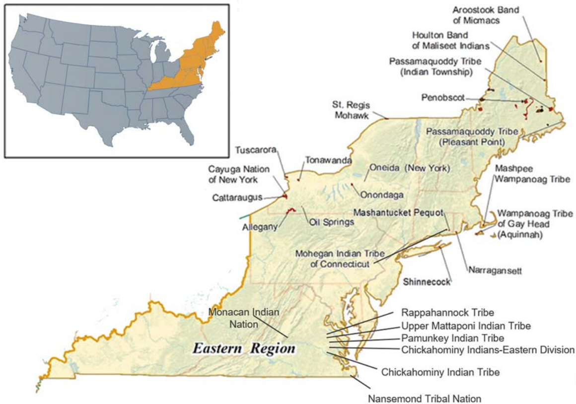
Figure 1. Northeastern and Mid-Atlantic Tribal Nations.

The map depicts the federally recognized Tribal Nations in the northeast and mid-Atlantic regions. However, not listed are state recognized Tribes, federally recognized Tribes with historical ties to the region (but due to colonization no longer have land holdings in the region), and other non-reservation Indigenous communities including urban Indigenous communities all of which have a range of potential associated water security climate change impacts due to SLR. The map is adapted from the Northeast Climate Science Center Tribal Partners programme ( https://necsc.umass.edu/indigenous-peoples-and-tribal-partners ).