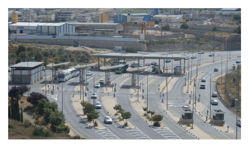
Figure 1. The tunnels checkpoint.

Walaja checkpoints do not revolve around checking the permits of the people travelling through them. This does not mean that these checkpoints do not control and discipline the passages of (some of) its users. More specifically, these checkpoints bring together two different, but inherently connected, mobility regimes: providing Jewish settlers swift passage, while simultaneously stopping and controlling Palestinians with Israeli and Jerusalem ID cards - who can be stopped by the soldiers for a short chat, an ID check or a search of their car, but who can also be denied passage or even be detained.