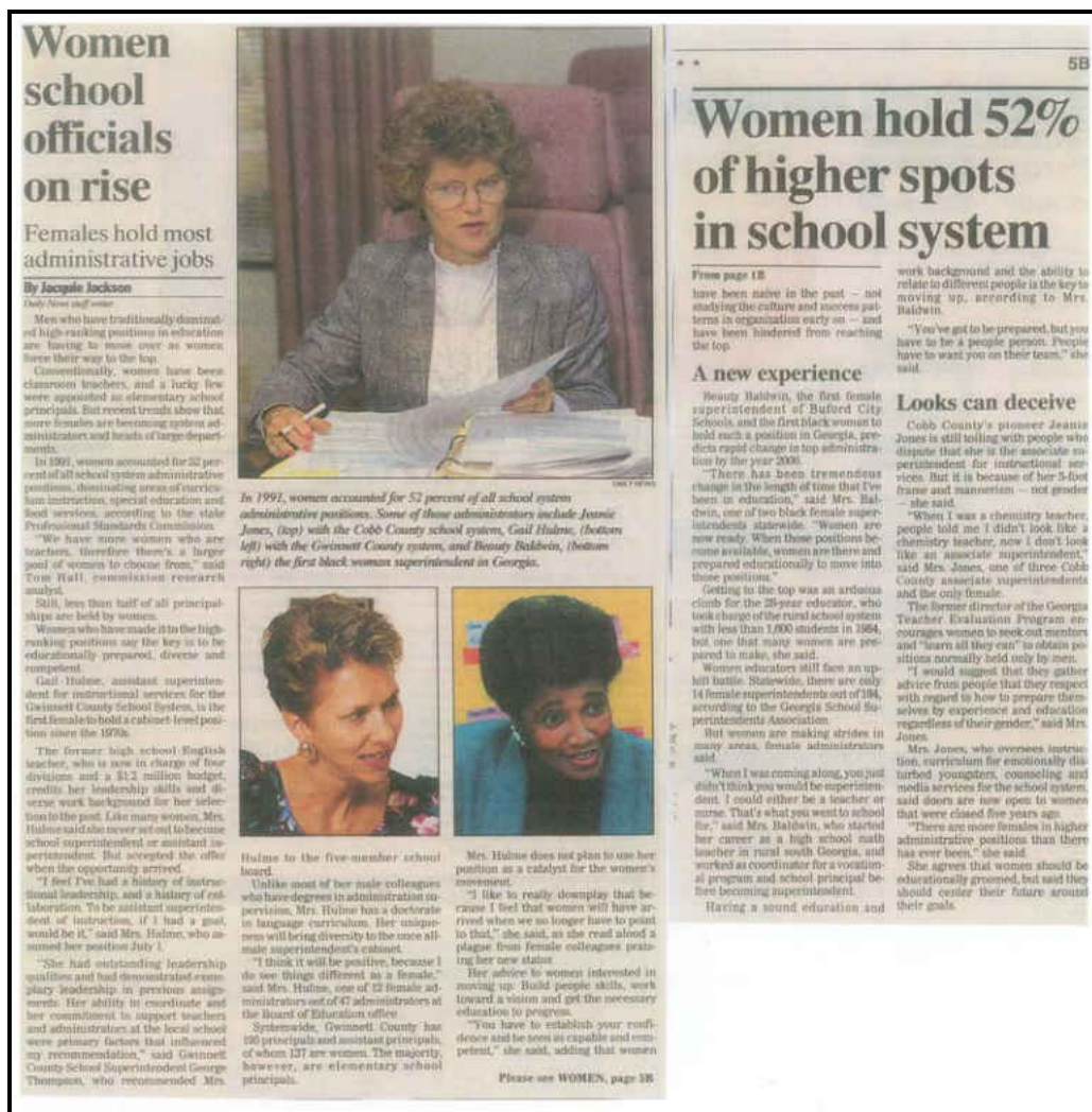
Figure 2: Women School Officials on Rise, Atlanta Journal and Constitution , Date Unknown.