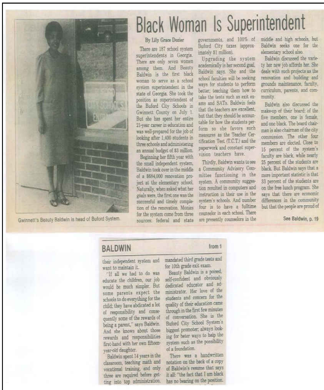
Figure 4: Black Woman is Superintendent, Atlanta Women's News , October 1, 1984.