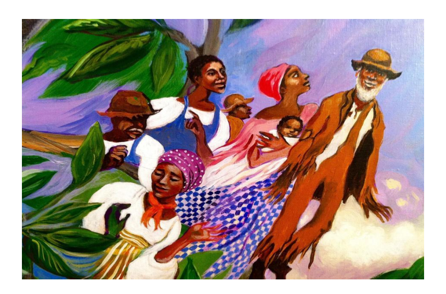
Figure 2. The People Could Fly, illustrated by Leo and Dianne Dillon, 1985

The Flying African myth appears in different versions of picture books, YA, and adult contemporary literature.