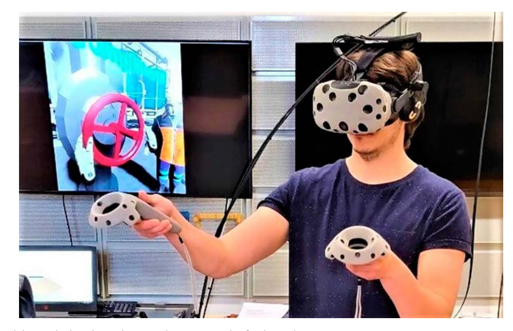
Figure 3. A participant closing the main gas valve to arrest the fire hazard.