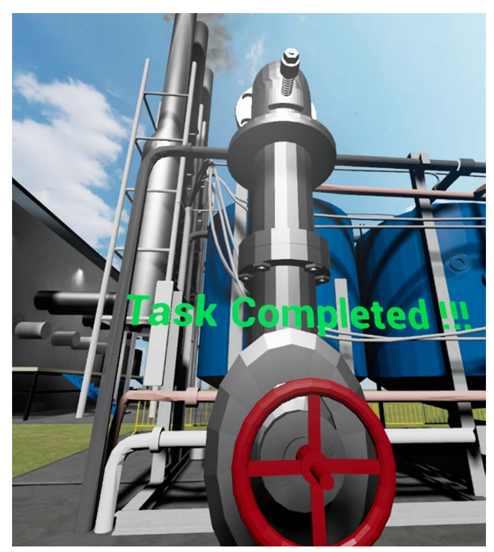
Figure 4. Completion of the EPR assessment. Note: EPR = emergency preparedness and response.

effectiveness of the evacuation and mitigation exercises, we hypothesize the following.