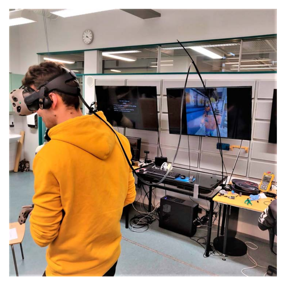
Figure 2. A participant evacuating the power plant at the onset of fire.