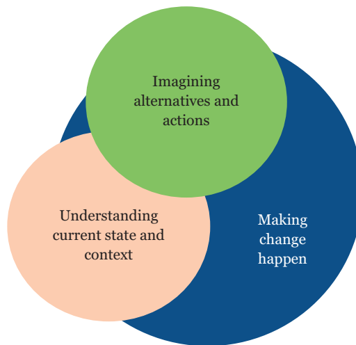
Figure 2. Overlapping phases in policy design.

concern for context, distributed leadership and adaptive learning in systemic design means there is no universal process that can be applied to every situation. Rather than a stage-based linear process, it can be more helpful to think of overlapping “spaces” of design, which Bason (2017, 80–83) names, “exploring the problem space,” “generating alternative scenarios” and “enacting new practices”. We adapted this model in a recent policy design project, as shown in Figure 2, with simpler names for the key spaces, summarized as: “understanding,” “imagining” and “making” (Blomkamp 2020b). Whichever process model or schema is used, it will offer an overarching organizing strategy with different spaces, phases or stages to navigate, which will also connect with methods for coordinating, documenting and communicating action.