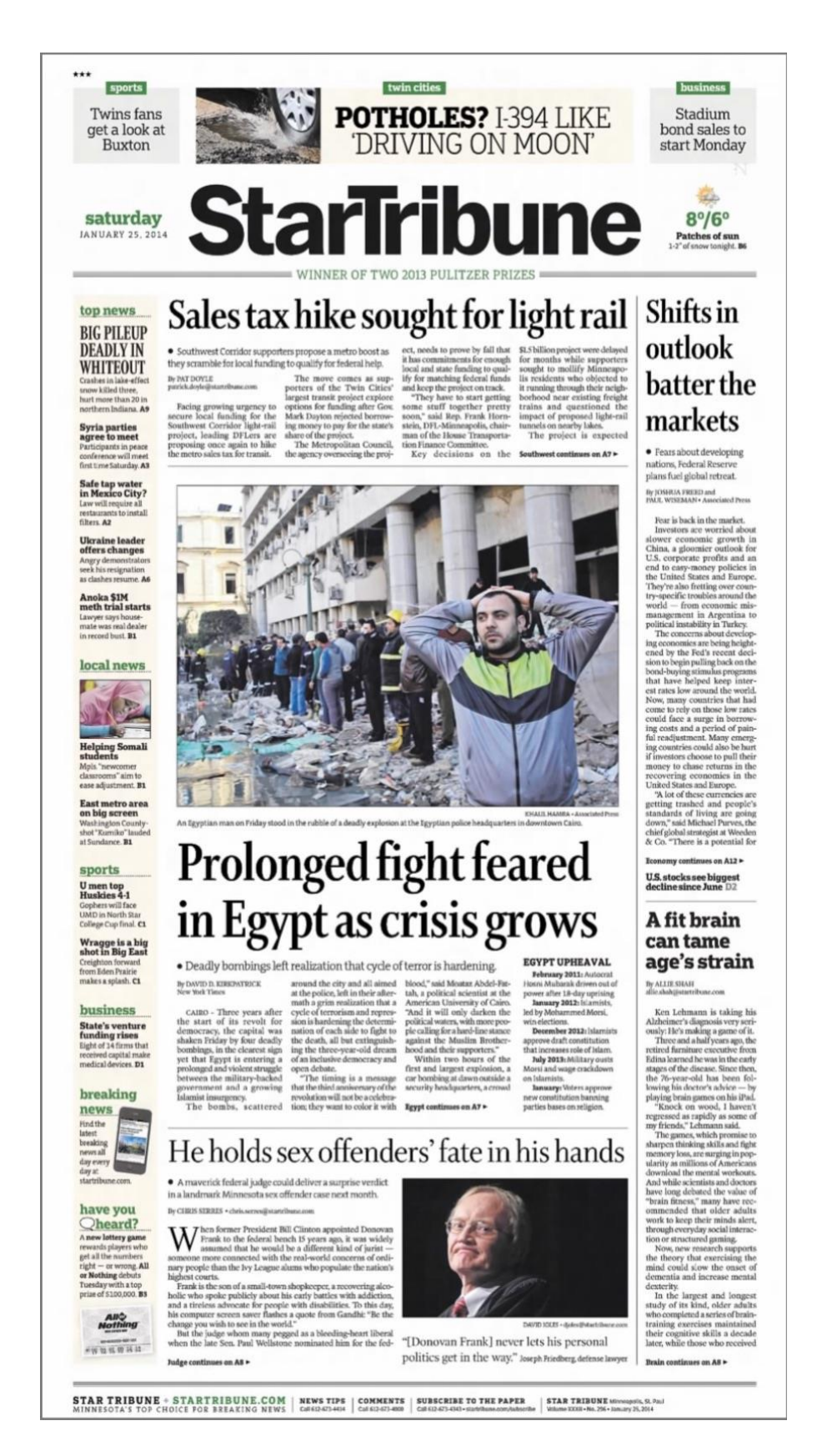
Image 2 - average front-page of The Star Tribune (circa January 2014)