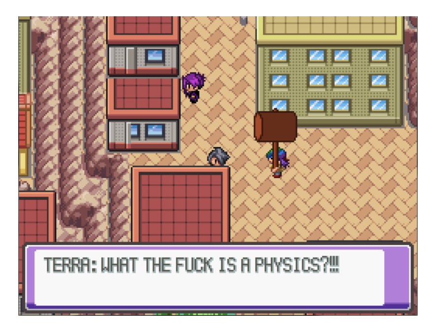
Figure 4: Terra's First Appearance in Pokémon Reborn . This introduces players to both leetspeak and her queer movement. ("Reborn Pokémon," MasterPoké , accessed February 29, 2020, https://master-Poké.forumactif.fr/t16825-Pokémon-reborn)

Yet it's Terra's movement through digital space that most resonates with glitches and queer movement. After the avatar discovers Terra works for the evil Team Meteor, Terra escapes into her complex computer network, transitioning from one computer game to another. Like in the normal gameworld of Pokémon Reborn , Terra can jump large distances and move quickly through the world. At one point, Terra almost flattens the avatar with her signature hammer. She routinely smashes large areas of the gameworld to create glitches, impeding the avatar's progress through the aptly named Glitch World. The gameworld inside Terra's computer replicates both the gameplay system and design of Pokémon Red and Green . The avatar travels through many areas from the original Pokémon games, including Victory Road and Mt. Moon. The Glitch World also features several areas from Pokémon Reborn that have been restyled in the design of the original Pokémon games. Pokémon and trainers inside Terra's computer also glitch out. Inbattle trainer sprites appear as glitched images or the infamous Missingno glitch from Pokémon Red and Green , further blurring the boundaries between player and game(s). Terra not only