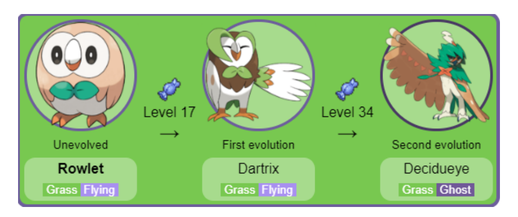
Figure 2: Evolutionary Line of Rowlet ("Rowlet (Pokémon)," Bulbapedia, accessed February 24, 2020, https://bulbapedia.bulbagarden.net/wiki/Rowlet_(Pokémon))

When Pokémon win a Battle, they gain Experience Points (EXP). If a Pokémon gets enough experience points, they grow by one Level and receive a boost to their strength in several areas, called Stats. If a Pokémon grows a certain number of levels or achieves several other requirements, they will evolve into a stronger species of Pokémon.