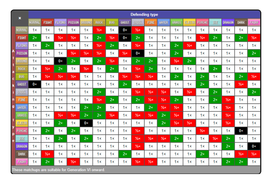
Figure 1: Current Type Match-Up Chart for Pokémon Games ("Type/Type Chart," Bulbapedia, accessed February 24, 2020, https://bulbapedia.bulbagarden.net/wiki/Type/Type_chart.)

When Pokémon win a Battle, they gain Experience Points (EXP). If a Pokémon gets enough experience points, they grow by one Level and receive a boost to their strength in several areas, called Stats. If a Pokémon grows a certain number of levels or achieves several other requirements, they will evolve into a stronger species of Pokémon.