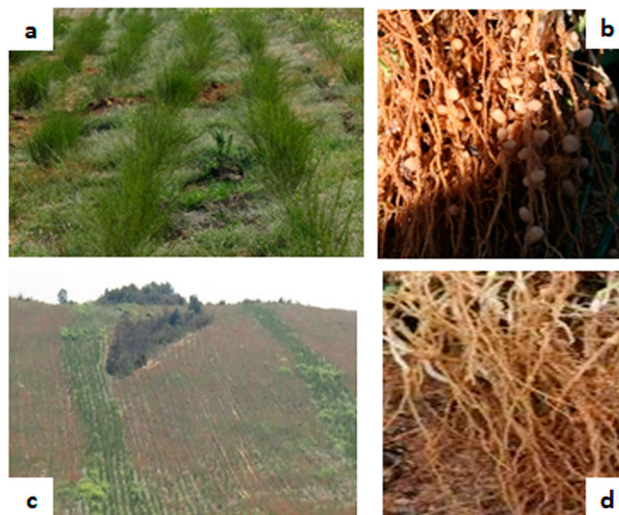
Figure 1. Photo showing rooibos plants in the healthy and declined plants. Note that plants in the healthy soil look greener and taller (a) with many big and pink nodules (b) whereas plants in the declined soil have less growth with stunted and yellowish appearance (c) and very few tiny nodules (d).

Sequence analysis of the 16S ribosomal RNA of the isolates revealed that more than 75% of the isolates from the nodules of healthy soils belonged into the Rhizobium – Bradyrhizobium group and the remaining 25% were identified as Bacillus , Burkholderia and Pseudomonas spp. (Figure 2). Phylogenetic tree constructed from the analysis of the 16S ribosomal RNA sequence of bacterial isolates from healthy and declined rooibos nodules grouped the bacteria into five major groups in which 75% of the isolates that fall under the Rhizobium – Bradyrhizobium – Mesorhizobium clades (group I) are those isolated from the nodules of the healthy plants (Figure 2). In the nodules from the declined plants, the proportion of the root-nodulating rhizobia is very low and most of the isolates were grouped under groups II–IV in the neighbor-joining tree that contains strains of Burkholderia , Pseudomonas and Bacillus spp. (Figure 2).