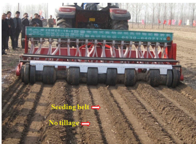
Figure 3. Belt-planting in a strip tillage system showing direct wheat sowing immediately after maize harvest using a strip rotary drill.

The wheat-maize rotation planting system is always characterized by a large amount of maize straw retention such as in the northern China cropping zone where land preparation and sowing are expensive and time-consuming for wheat cultivation. Numerous procedures are needed for wheat planting, including maize straw smashing, tillage, soil raking and compaction. Using the newly developed wheat planter types, a strip (10–15 cm) is tilled ensuring a 7–12-cm seedling belt (Figure 3). When tilling, the residue is simultaneously cut again and mixed with the soil. The ground (10–15 cm) between the tilled strips is left undisturbed. This type of planter can accomplish subsoiling (using four vibration subsoilers with a working depth of approximately 35 cm), strip rotary tillage (15–18-cm deep), base fertilizer application, precision sowing, soil covering and compaction during the same run and thereby reduce the number of field operations required