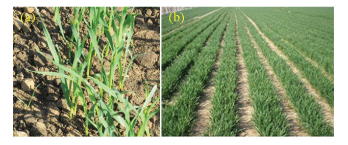
Figure 1. Wheat plants grown in a belt-precision planting system showing strong and uniformly distributed seedlings (a) and the planting configuration and wide seedling belt (b).

As expected, belt-precision planting ensures uniform stand establishment, better plant growth (Figure 1) and strong tillering and therefore significantly increases the number of tillers per plant and number of secondary roots; both were higher compared to those in conventional-cultivation planting (Fan et al., 2014; Li et al., 2015). Belt-precision planting is effective for optimizing the vertical PAR distribution in the wheat canopy and maintaining a higher leaf area index during early or late growth stages, and this