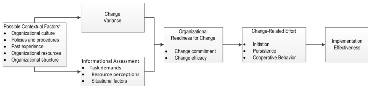
Figure 1. A theory of organizational readiness for change (Weiner, 2009).

Readiness in each hospital is achieved through organizational culture, institutional policies and procedures, past experience with change implementation, as well as resource availability. Of specific relevance to this study, resource availability refers to both human resources and monetary resources. Therefore, the collective readiness of Tennessee hospitals was affected by multiple variables. Rural hospitals with fewer resources, both human and monetary, most likely experience additional challenges that decrease the level of readiness. In the Weiner Theory there is also consideration for the influence of the initiator of the change. Because the federal government was the initiator of this change, the readiness of the organization has been affected. The initiator influence is a direct influence on implementation effectiveness. Figure 1 depicts the concepts of the theory of organizational readiness for change appropriate to the hospital readiness for the implementation of the Electronic Health Record.