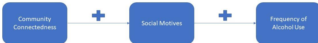
Figure 4. Proposed Data Analysis for Indirect Effect of Community Connectedness on Frequency of Drinking