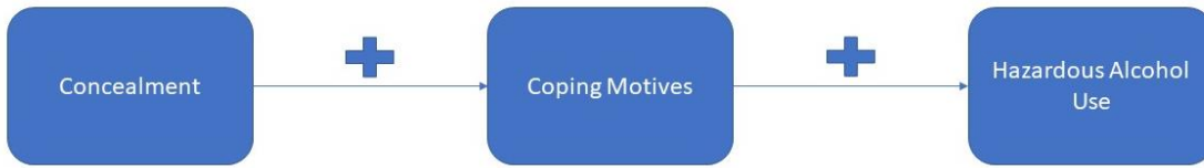
Figure 3. Proposed Data Analysis for Indirect Effect of Concealment on Hazardous Alcohol Use