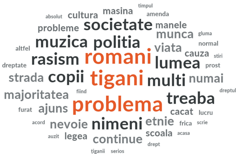
Figure 1. Most common 40 words in Romanian.

Figure 1 shows, through a word cloud, the distribution of the 40 most common Romanian words 3 employed by the users of Reddit Romania (N = 4,136), these being in English: Gypsies, Romanian, problem, many, children, the police, the world, no one, racism, the music, society, [to have] trouble, life, most of them, made, ethnicity, the work, need, continue, no more, the street, the cause, shit, problems, school, Manele [music attributed to the Roma], car, culture, the law, fear, fine [punishment], justice, work, normal, dumbass, otherwise, stealing, agreement, being, news, the home, write, [to be] serious, heard, [to be] right, [to have] the right, joke, time, the Gypsies, and absolute.