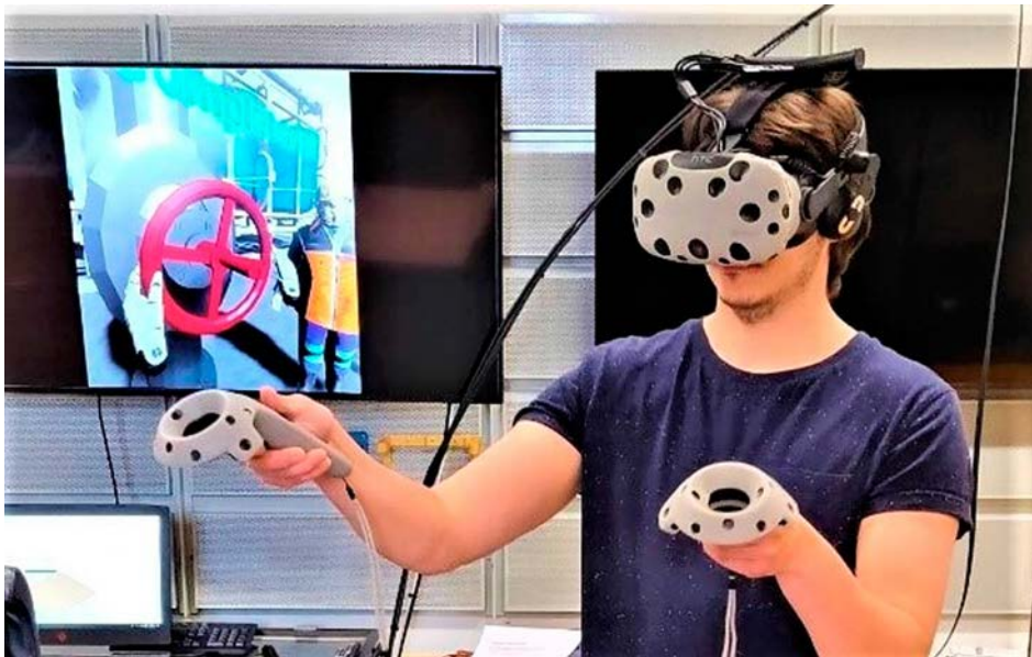
Figure 3. A participant closing the main gas valve to arrest the fire hazard.