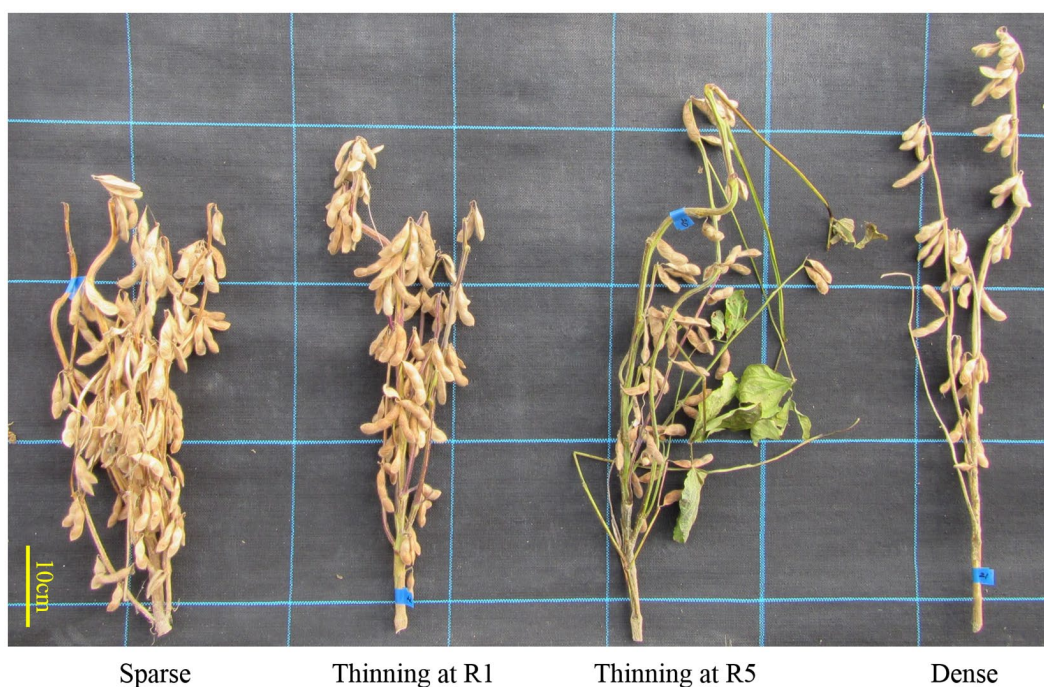
Figure 2. Appearance of representative plants after R8 in the four treatment plots in Exp. 1 in 2014.

GSD scores of the treatments thinned at growth stage R5 were significantly higher (3.6 to 4.0) than those of the other treatments in the three years (Table 4). Mean GSD score in 2014 and 2015 of the treatment thinned at growth stage R1 was significantly higher than those of the treatment in which plant population was kept dense or sparse and