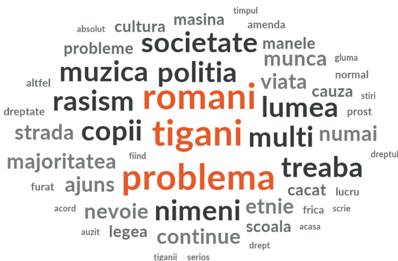
Figure 1. Most common 40 words in Romanian.

Figure 1 shows, through a word cloud, the distribution of the 40 most common Romanian words 3 employed by the users of Reddit Romania (N = 4,136), these being in English: Gypsies, Romanian, problem, many, children, the police, the world, no one, racism, the music, society, [to have] trouble, life, most of them, made, ethnicity, the work, need, continue, no more, the street, the cause, shit, problems, school, Manele [music attributed to the Roma], car, culture, the law, fear, fine [punishment], justice, work, normal, dumbass, otherwise, stealing, agreement, being, news, the home, write, [to be] serious, heard, [to be] right, [to have] the right, joke, time, the Gypsies, and absolute.