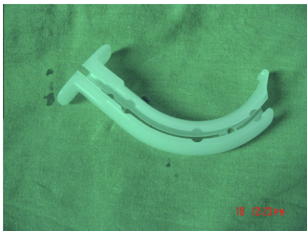
Figure 2 Berman's airway.