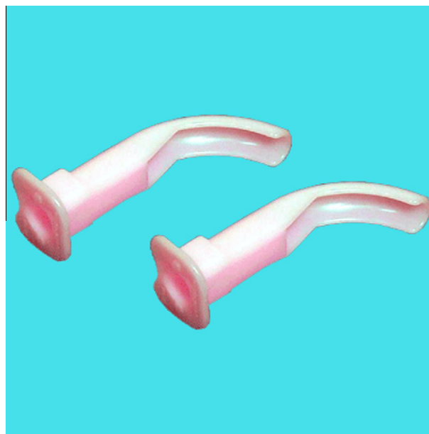
Figure 4 Williams' airway.

A combination of Trachlight and MADgic atomizer can also provide excellent topical anaesthesia of the airway for awake orotracheal intubation. This technique is easy to perform, well tolerated by the awake patient, and useful in difficult intubation but transillumination can be the problem in patients having dense fibrous band [9]. If all above maneuver fails we are left with option of release of contracture and