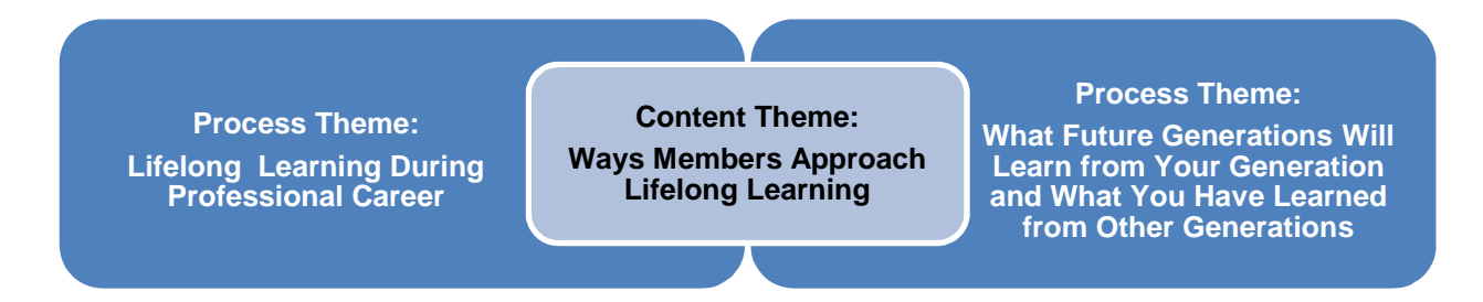
Figure 3. Content theme – ways members approach lifelong learning and two process themes.

The second research question is: What are ways that different generational representatives use lifelong learning in their professional and personal lives? One content theme and two process themes are represented in the data. The themes are outlined in Figure 3.