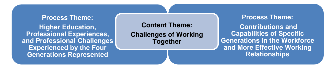
Figure 2. Content theme – challenges of working together and two process themes.

The first research question is: What are the professional and personal challenges that four generational representatives working together in the higher education setting encounter? One content and two process themes were identified from the data. These themes are outlined in Figure 2.