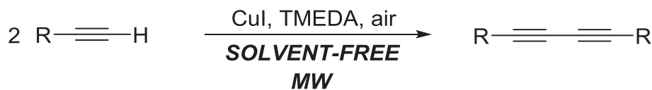
Scheme 1. Homocoupling reaction of terminal acetylenes.

involving the combination of solvent-free conditions and microwave irradiation (Scheme 1).