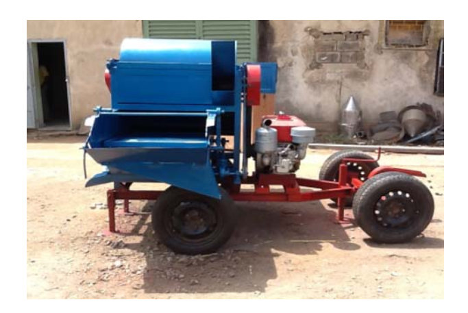
Plate 1: ASI Thresher