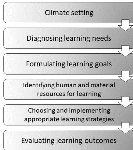
Figure 1. Knowles' six major steps of self-directed learning