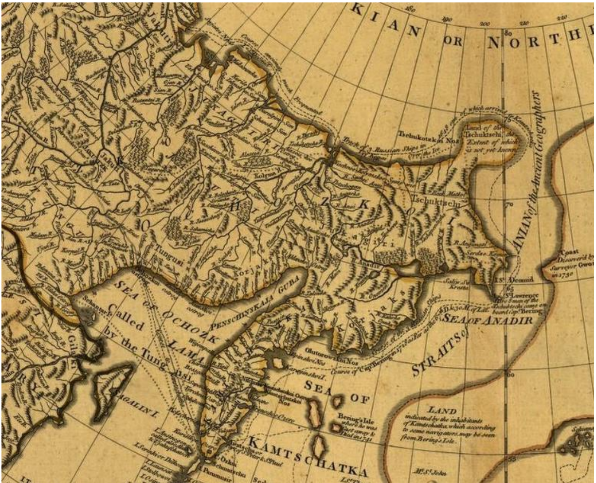
Figure 3. Map Detail of the Russian Far East, 1776. 116

In order to understand whaling practices, it is first necessary to understand the Bowhead whale itself. Bowhead whales are large, but slow-moving and timid creatures that can reach up to one hundred metric tons in weight and up to 17 meters in length. Stocks of Bowhead whales were common around the global Arctic, and it was the stock in eastern Arctic Ocean that became the target for industrial whaling. By 1530, numerous Basque ships from the Bay of Biscay were making the voyage into Arctic waters to harvest Bowheads. The reason lay in the thick layer of blubber hidden in the flesh of these enormous animals, and in the tough yet flexible baleen the