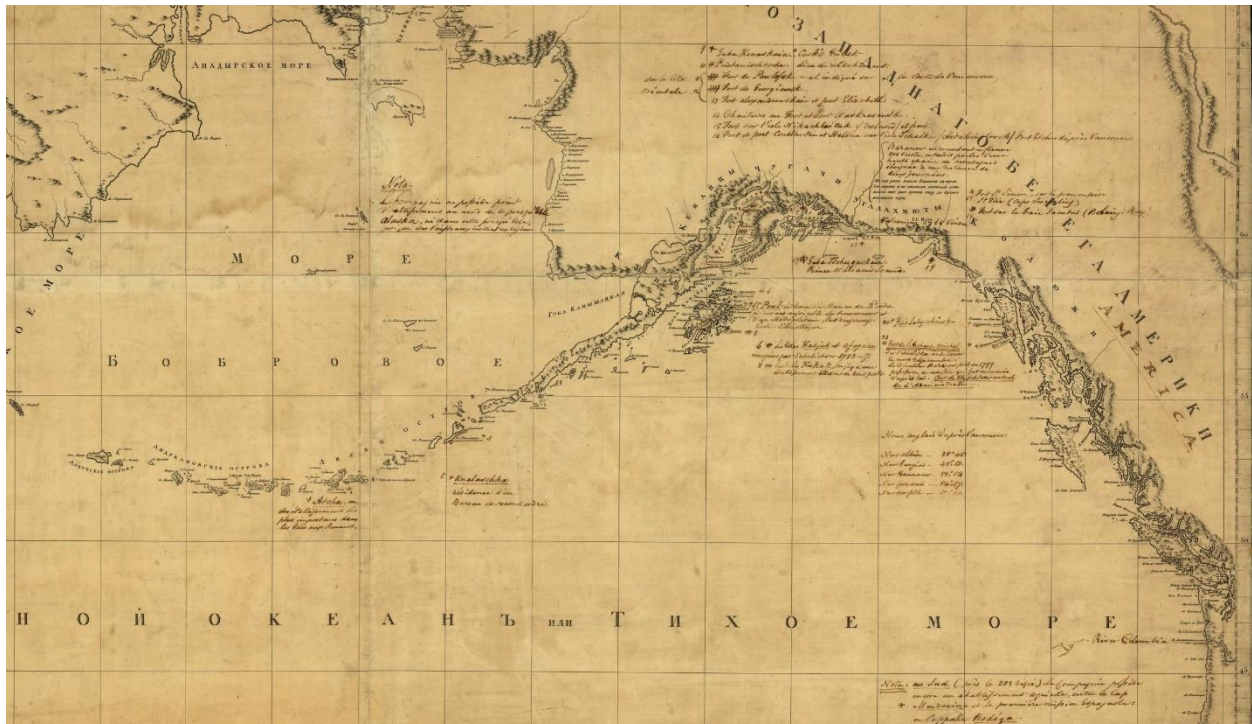
Figure 1. Map Detail of Russian Exploration of Alaskan Islands, 1809. 11 The details are almost exclusively coastal, reflecting the lack of desire, need, and ability to venture inland on the part of the Russians.

While this thesis will also provide several chronological details and mention pivotal events and personages for the benefit of the unfamiliar reader, the provision of a detailed account of the Russian eastward expansion is not the overarching goal of this project and has been more fully accomplished in other works. In contrast to these other works, this thesis simply adds an additional dimension, one which is environmental, and even more specifically zoological in nature, to the existing relatively well-understood timeline of events in Russia's eastern empire. For a detailed account of the social changes and structures both in the imperial center and the colonies produced by the Russian colonial endeavor in the Pacific, Ilya Vinkovetsky's Russian America: An Overseas Colony of a Continental Empire is second to none. For a survey of Russian seafaring in the Pacific with ample details regarding ship design and naval procedure,