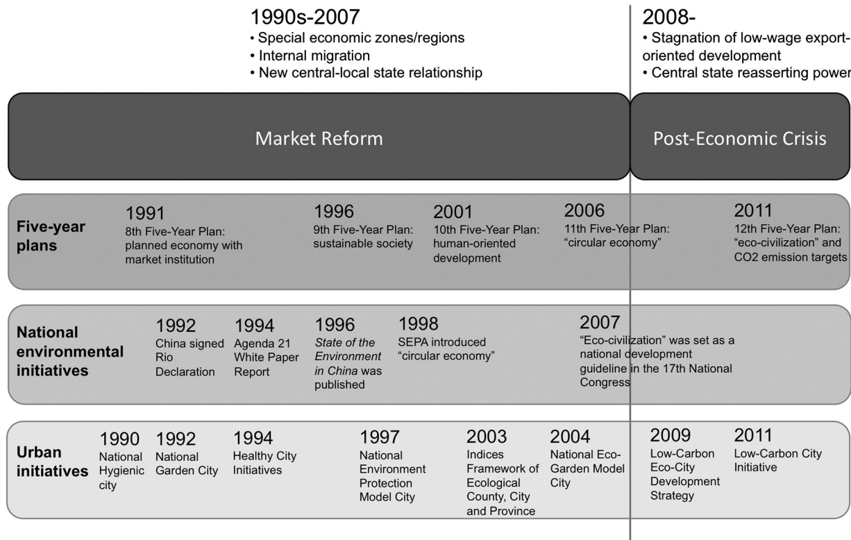
Fig. 1. Chinese eco-state restructuring since the 1990s

Environment Protection Bureau, the highest environment protection authority in the 1980s, was elevated in 1998 to a ministry-level apparatus, becoming the State Environmental Protection Agency. In 2004, the promotion and implementation of a circular economy was taken over by the National Development and Reform Commission, the State Council committee in charge of national economic and social development plans. In 2008, the State Environmental Protection Agency was further elevated, becoming the Ministry of Environmental Protection with the same administrative power as the ministries of Housing and Urban–Rural Development and of Commerce (the principal state agencies controlling economic development).