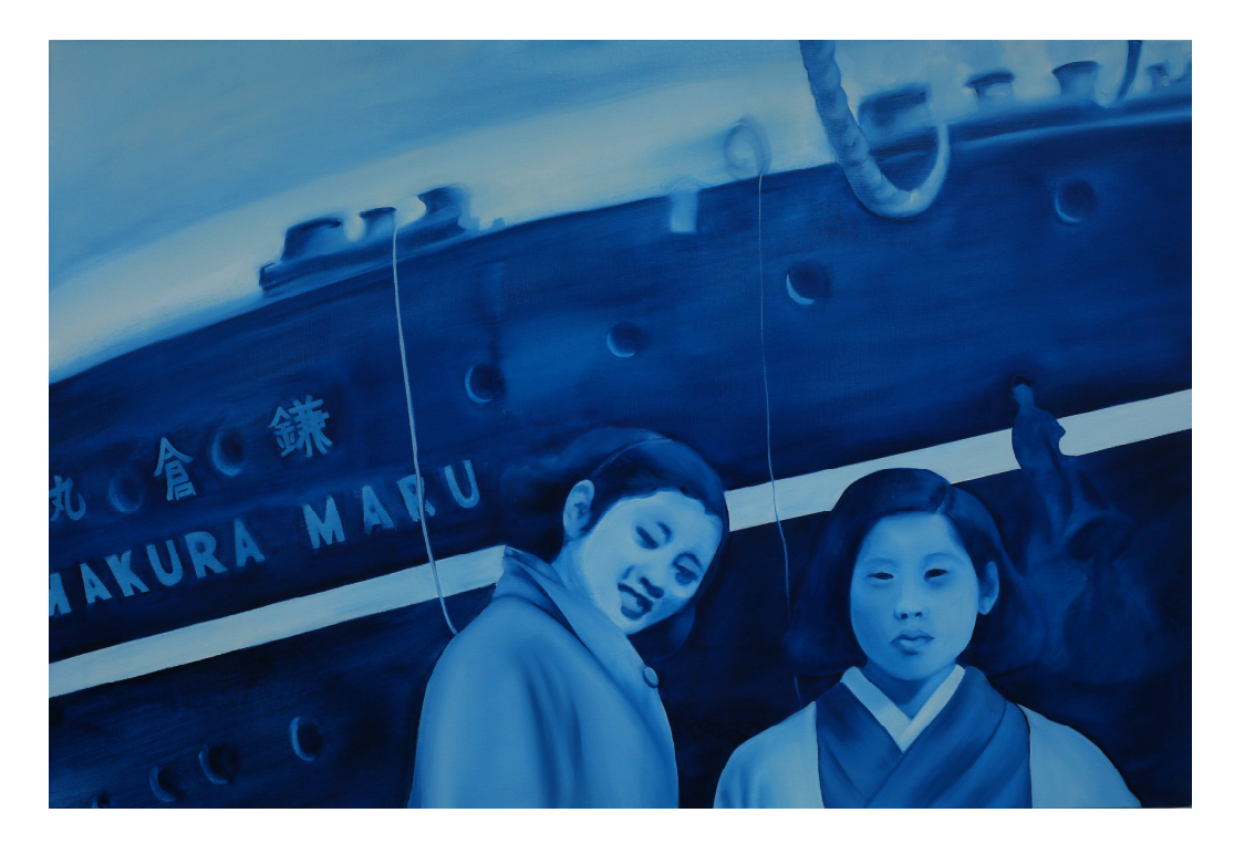
Fig. 3. "Nisei," by Laura Kina. 30 x 45, canvas, 2012.