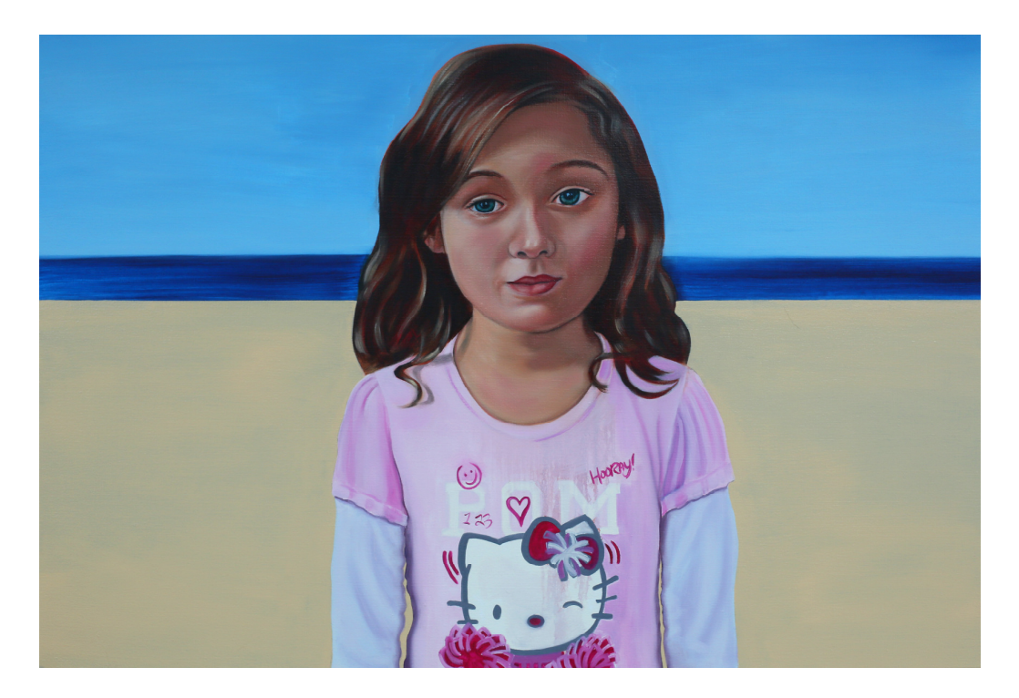
Fig. 6. "Gonsei," by Laura Kina. 30 x 45, canvas, 2012.

Aronson (pictured in Fig. 6), Okinawan-Spanish/Basque-Scotch-Irish-French-English- Dutch- Jewish . Thus we have in Kina the mixed figure as parent , as contributor of racial/cultural heritage, a huge shift from mixed figure as always only recipient . She is no longer the end point and resolution of mixed race, and while we might be tempted to see that mantle as simply shifting onto Kina's daughter, the series, as I will explain shortly, resists that pitfall as well.