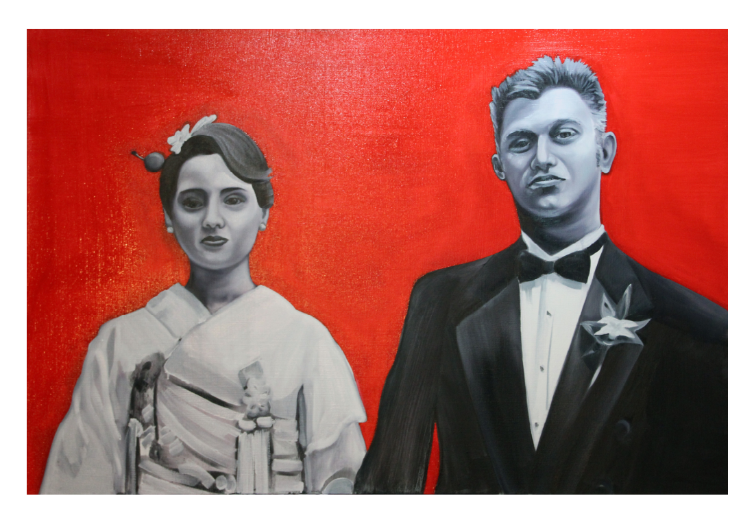
Fig. 5. "Yonsei," by Laura Kina. 30 x 45, canvas, 2012.