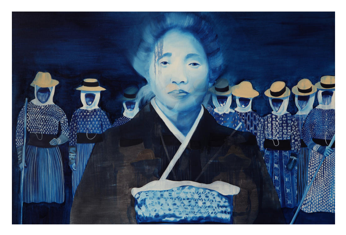
Fig. 2. "Issei," by Laura Kina. 30 x 45, canvas, 2011.